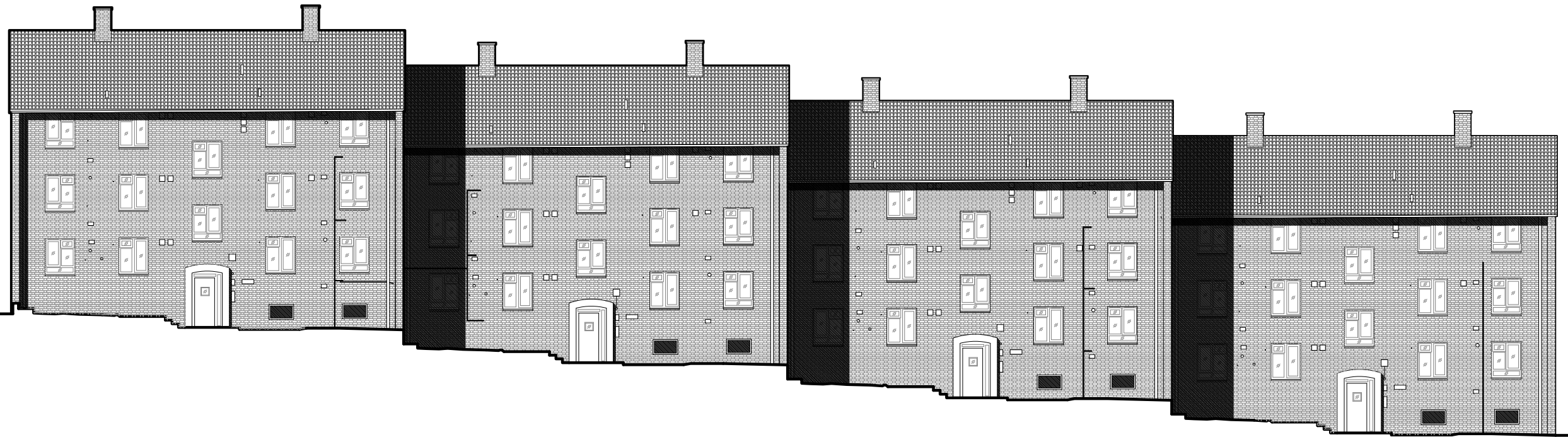
Elevation 2 (East)