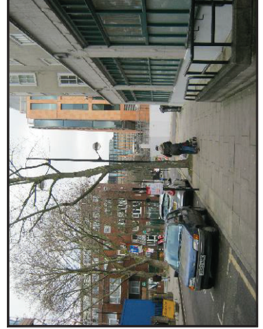
PANORAMIC PHOTO 1 (55')