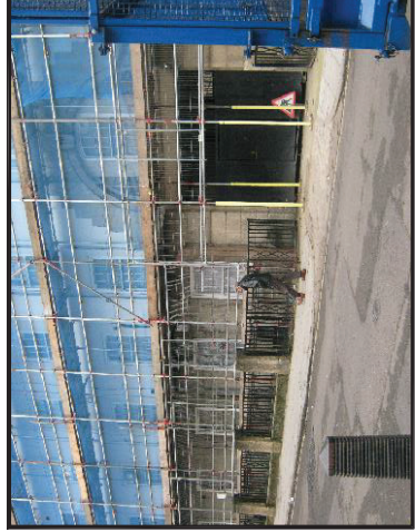
PANORAMIC PHOTO 4 (280')