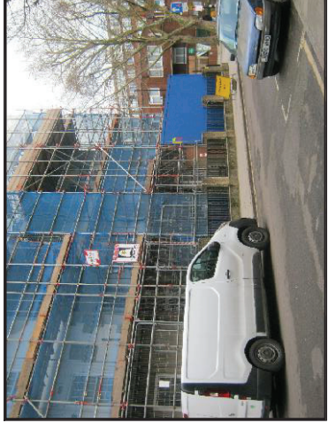
PANORAMIC PHOTO 2 (10')