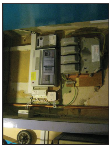
VIEW B – PROPOSED DISTRIBUTION BOARD LOCATION