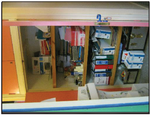
VIEW A – PROPOSED EQUIPMENT LOCATION