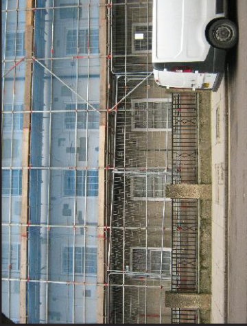
PANORAMIC PHOTO 3 (325')