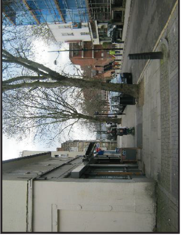
PANORAMIC PHOTO 5 (235')