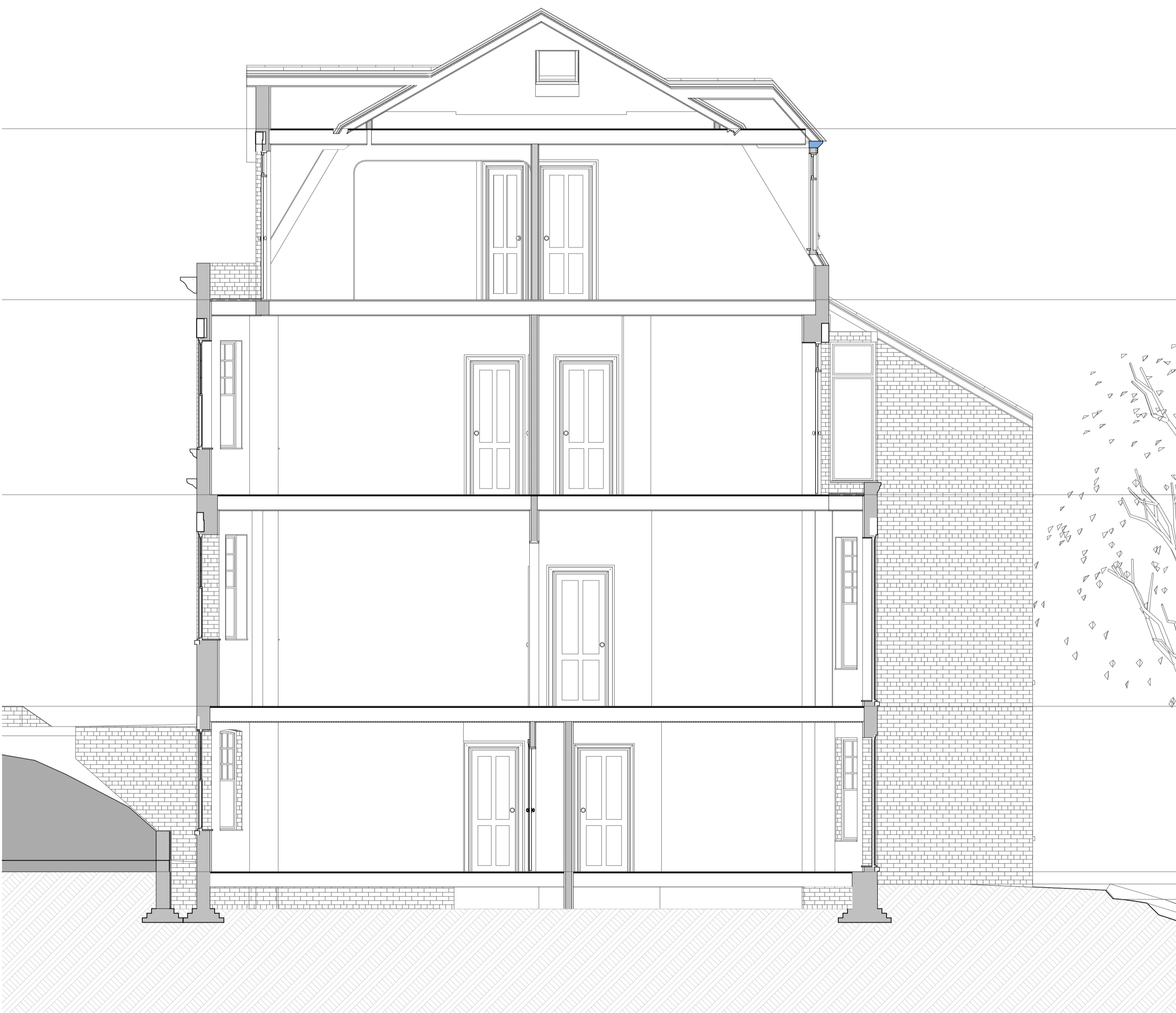
Section A-A as Existing 1:50