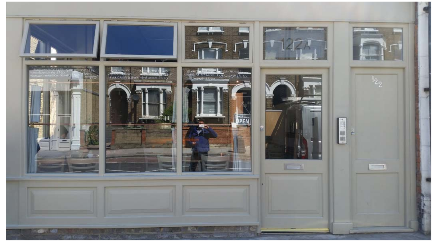
EXISTING adjoining shop front at 122 Fortress Road