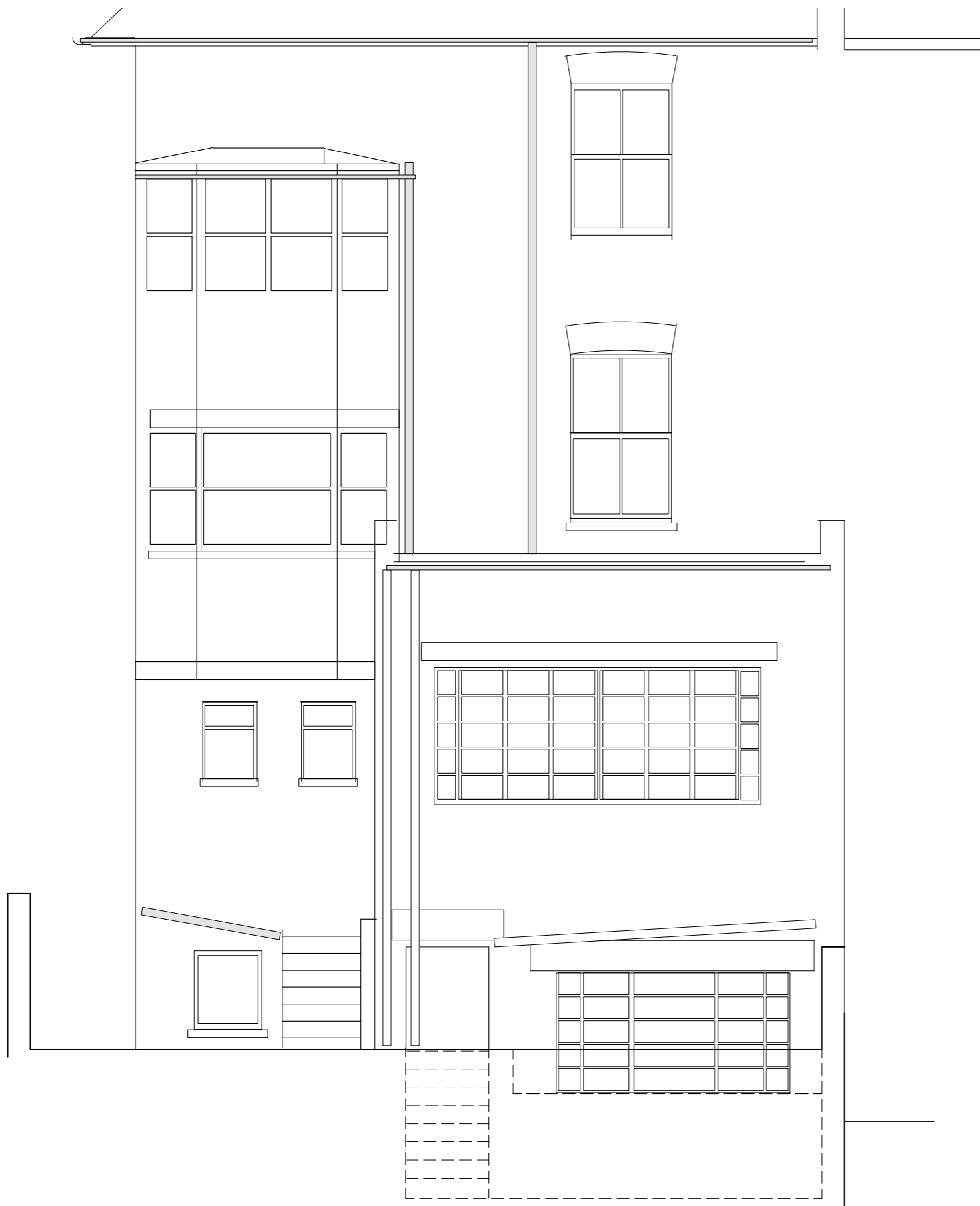
EXISTING GARDEN ELEVATION