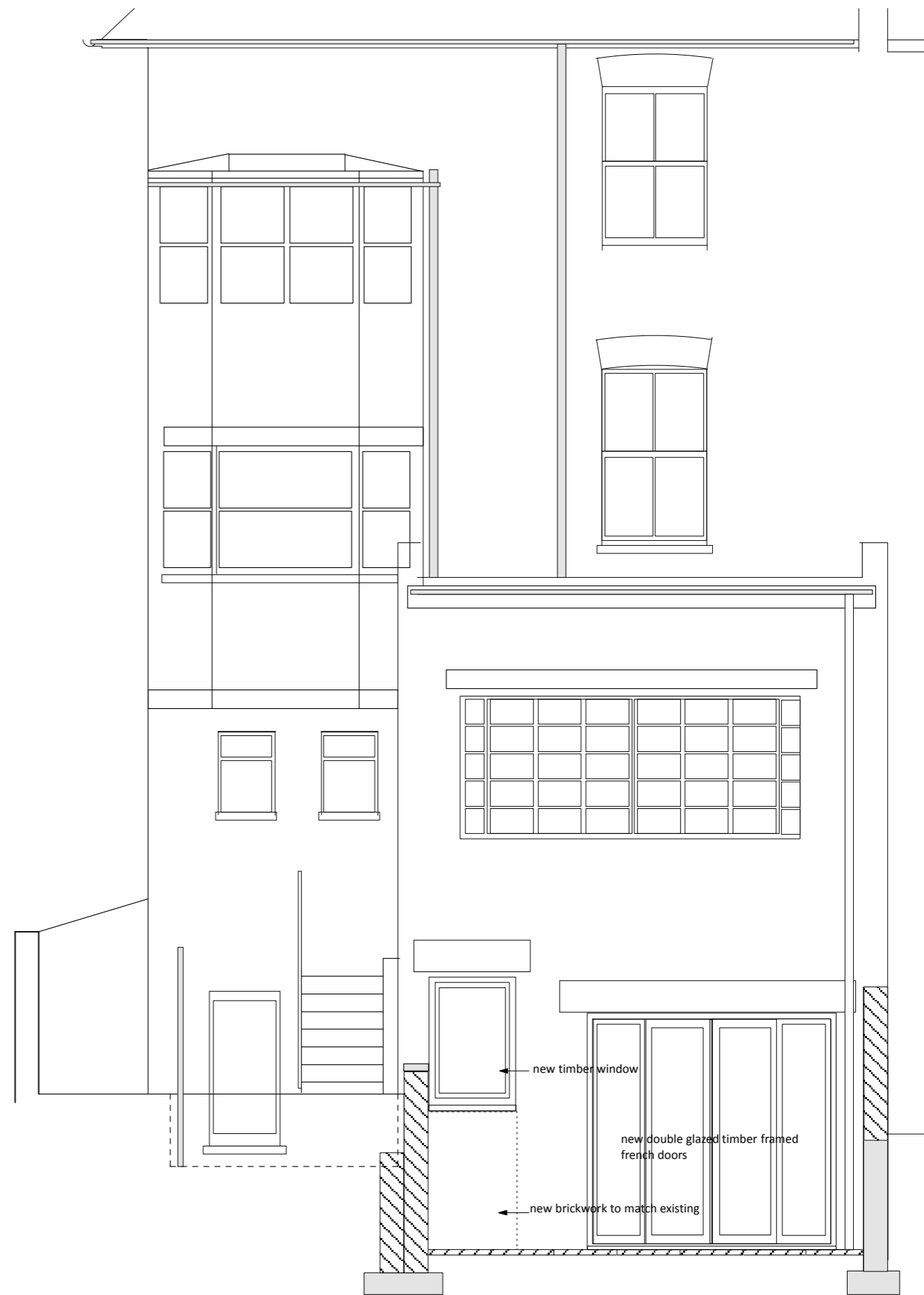
PROPOSED GARDEN ELEVATION