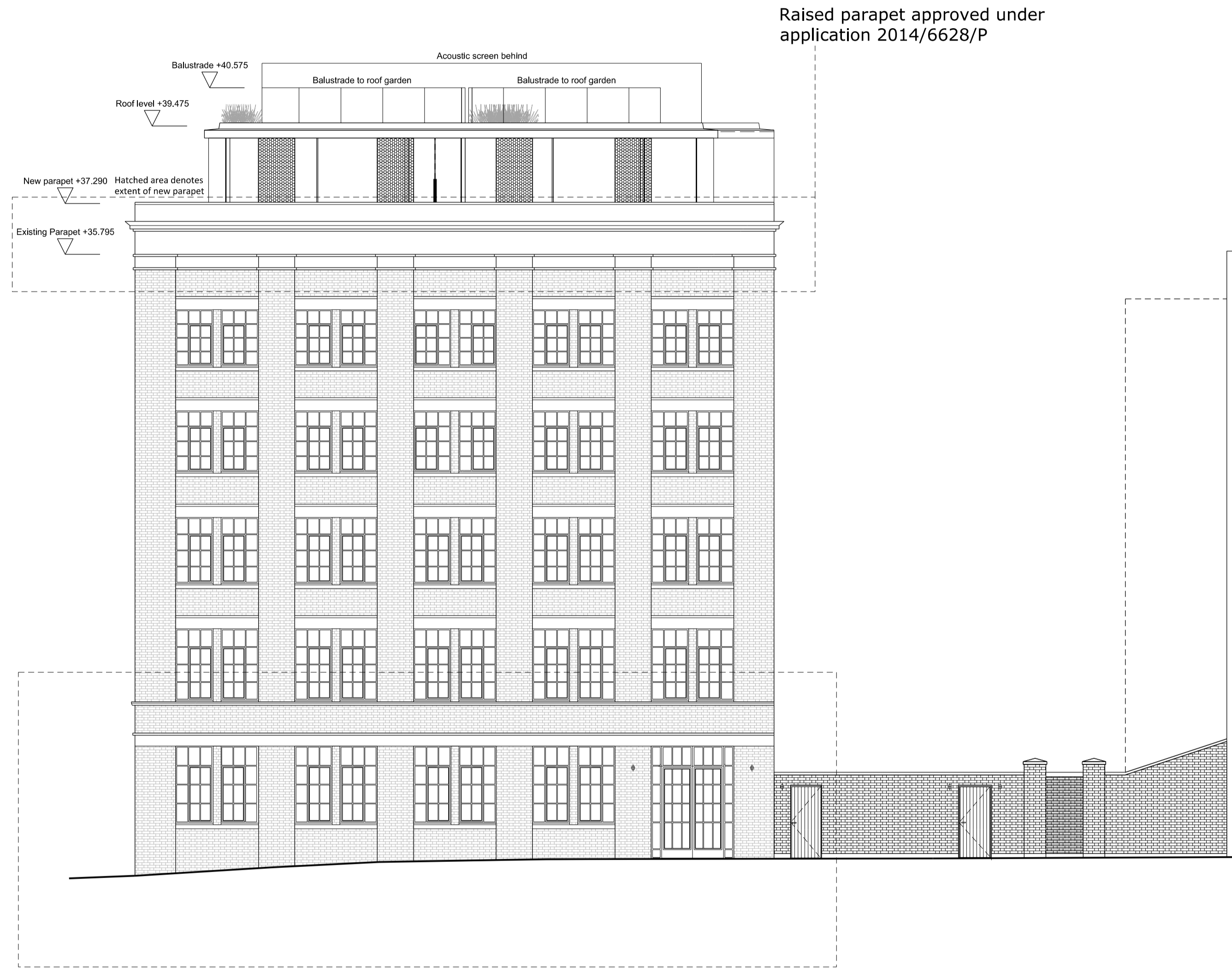
Ground floor elevation approved under application 2014/6628/P

Note: Do not scale from this drawing. All dimensions to be verified on site prior to the commencement of any work or the production of any shop drawing. All discrepancies to be reported to Clive Sall Architecture Ltd immediately. This drawing is to be read in conjunction with all related consultants drawings and any other related information.