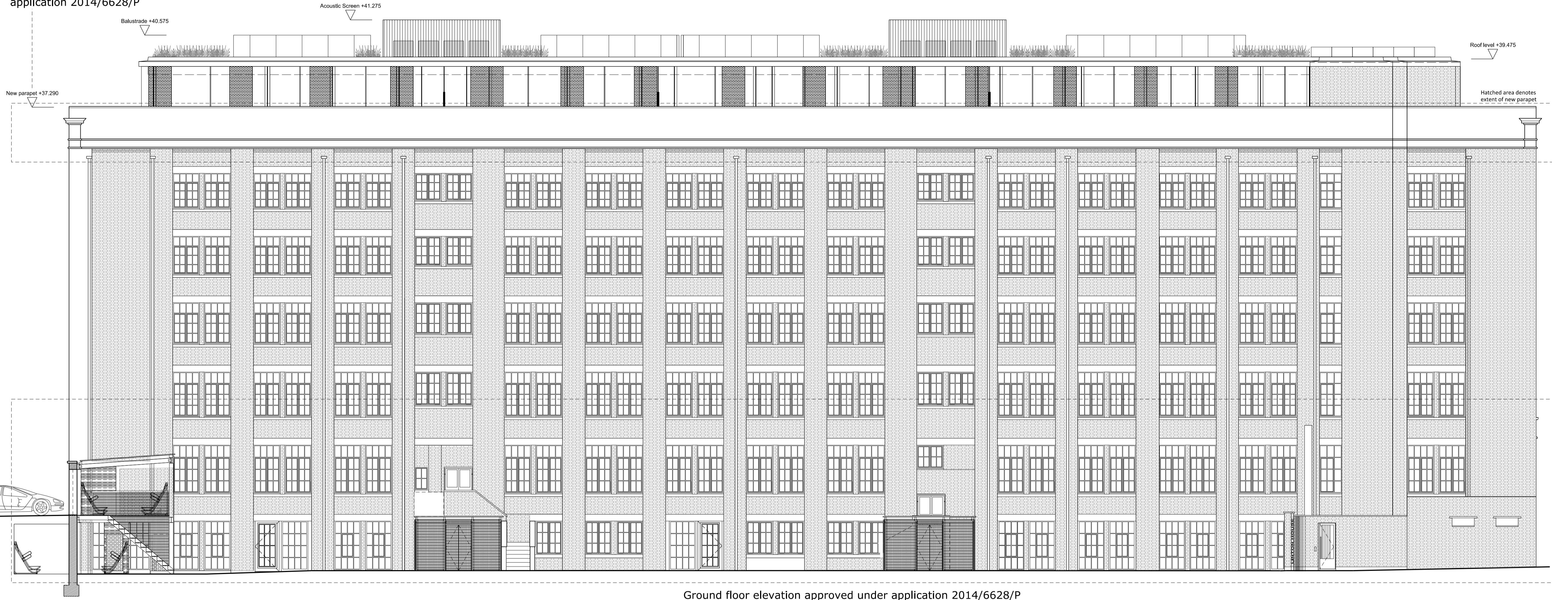
Ground floor elevation approved under application 2014/6628/P

Raised parapet approved under application 2014/6628/P