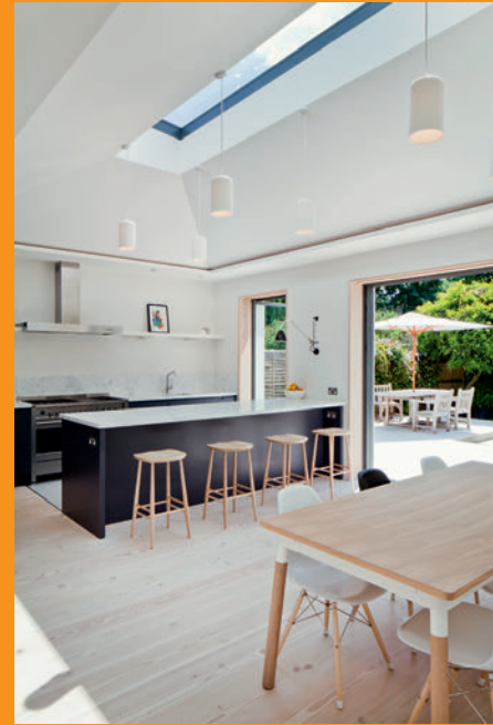
High Specification Flat Roof Skylights