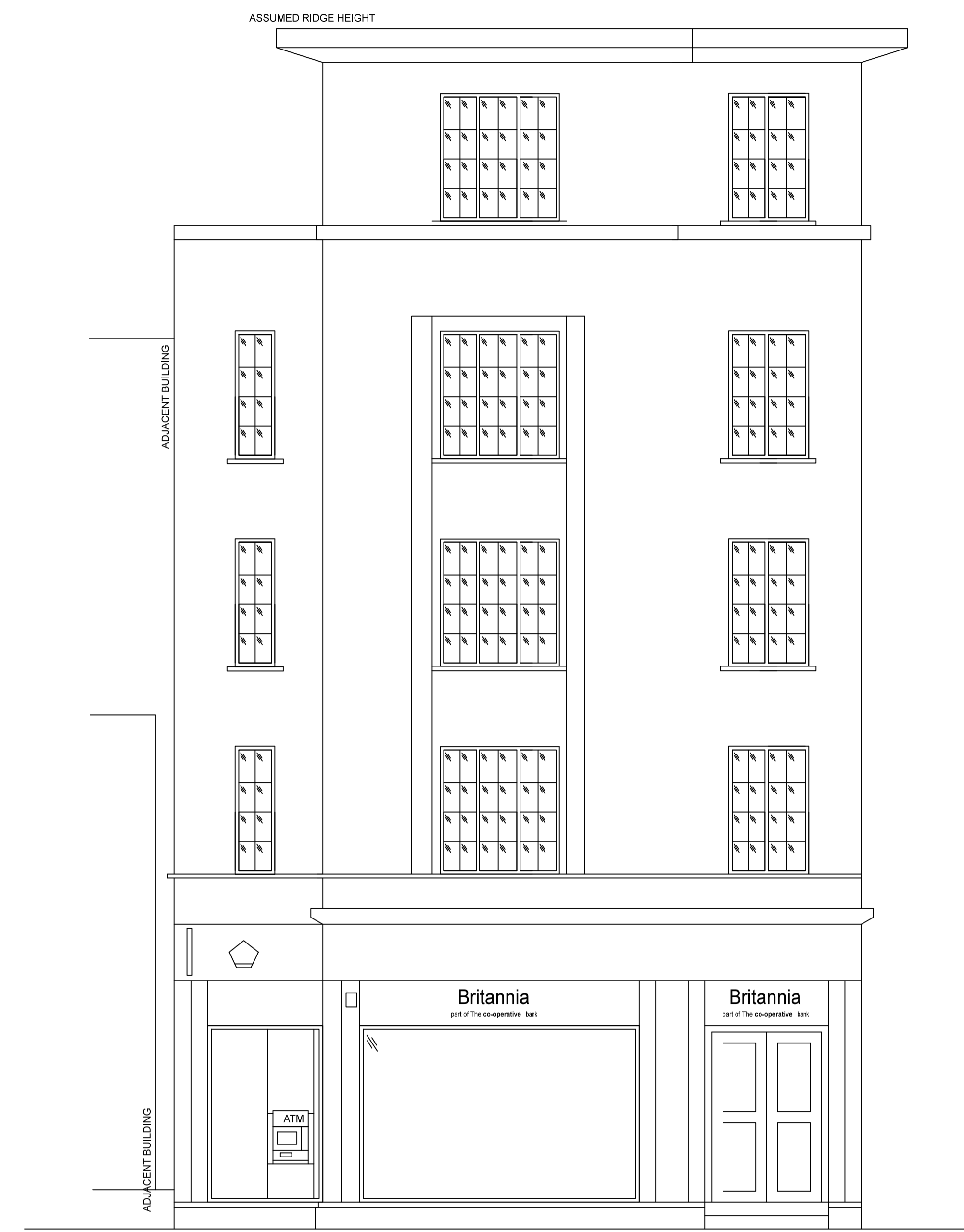
EXISTING ELEVATION A-A

POSITION OF PROPOSED ATM Allow to create new aperture to glazing to Left hand side of window. Allow to install new mullion to match existing to Right hand side of aperture to protect remaining original window. Allow for tinted security film to window up to new mullion. Allow to retain existing ATM position.