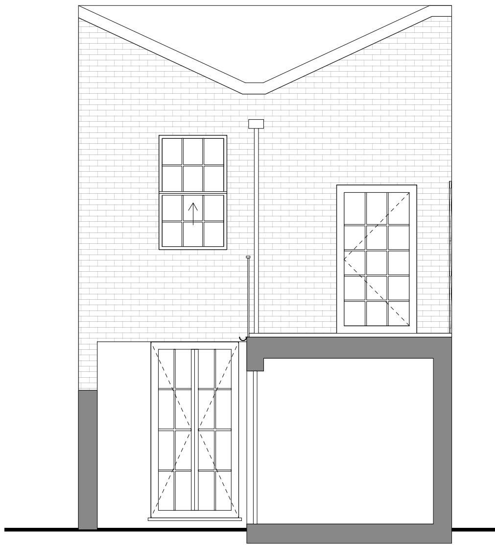
Rear Elevation Section