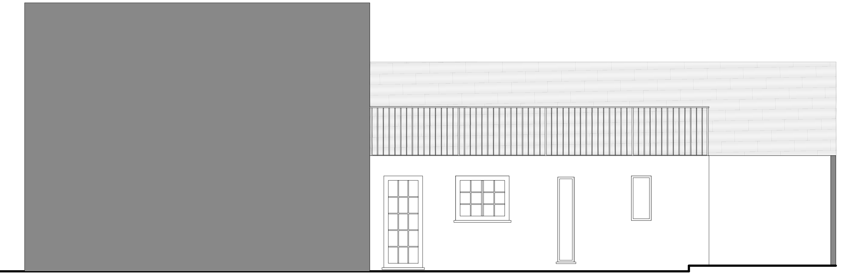
West Flank Elevation