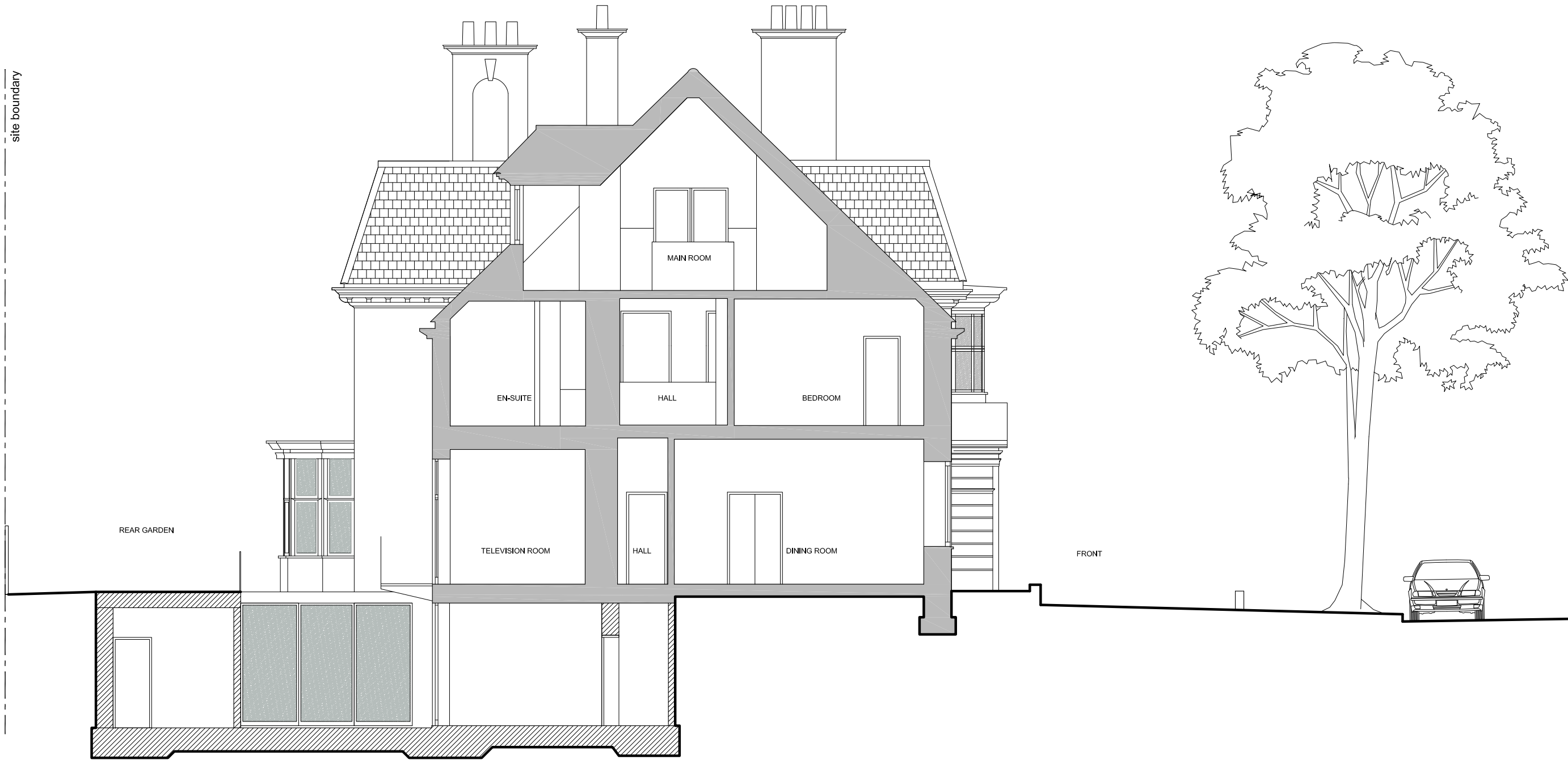
Proposed Section B Scale 1:50 @A1

Key Existing walls to be retained New walls & partitions