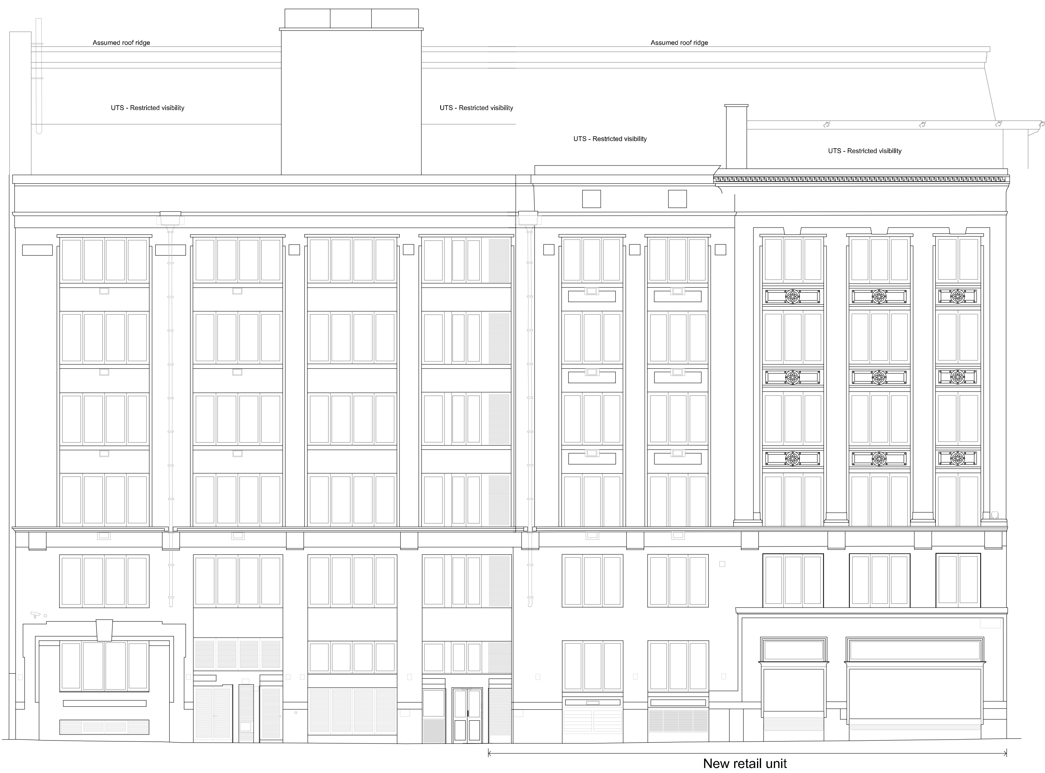
ELEVATION 5 (Remain) (Keeley St.)