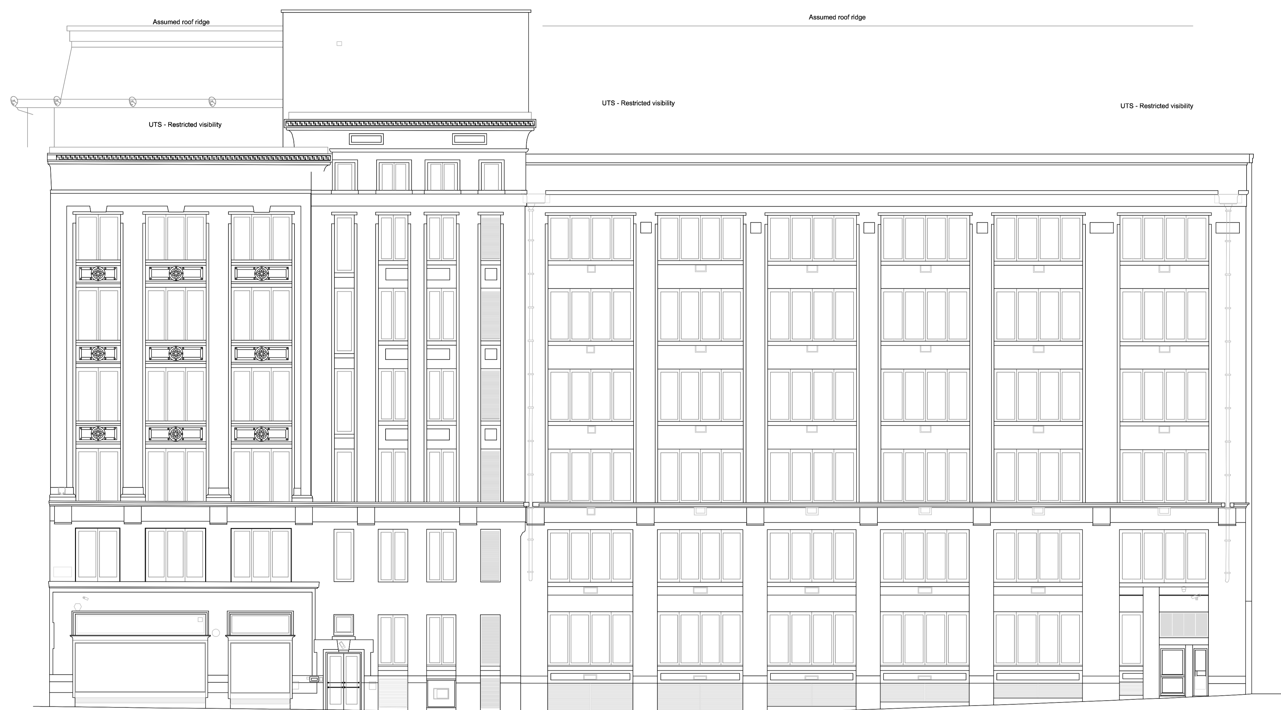
ELEVATION 1 (Wild Court)

A 16/07/15 Elevation 1 & 2 merged and renamed as "Elevation 1" GG IM