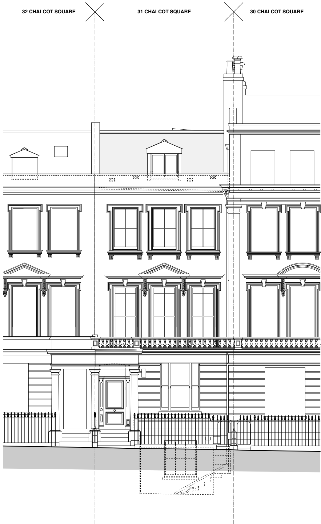
STREET ELEVATION AS PROPOSED