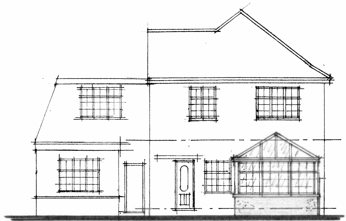
REAR ELEVATION - 1:100