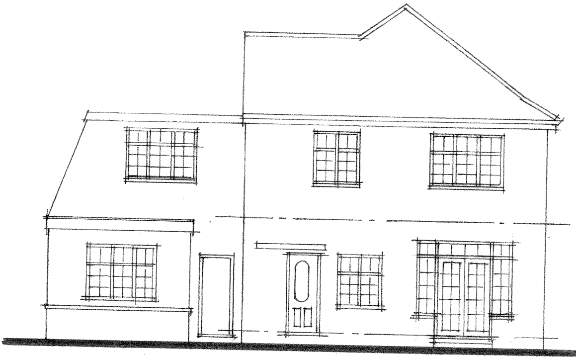
EXISTING REAR ELEVATION - 1:100