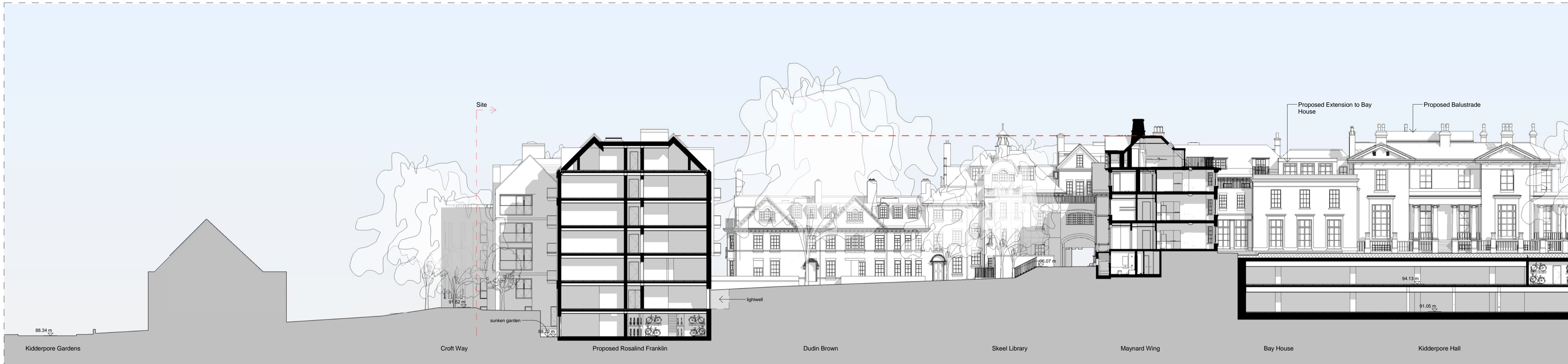
7 Eastern Side - South Section 1 : 250