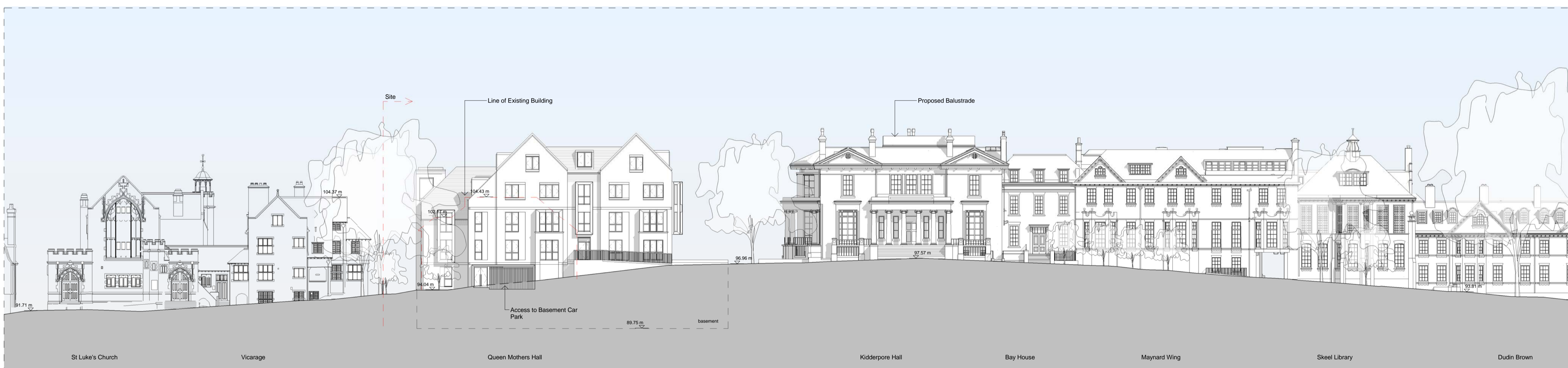
8 Western Side - Kidderpore Avenue South 1 : 250