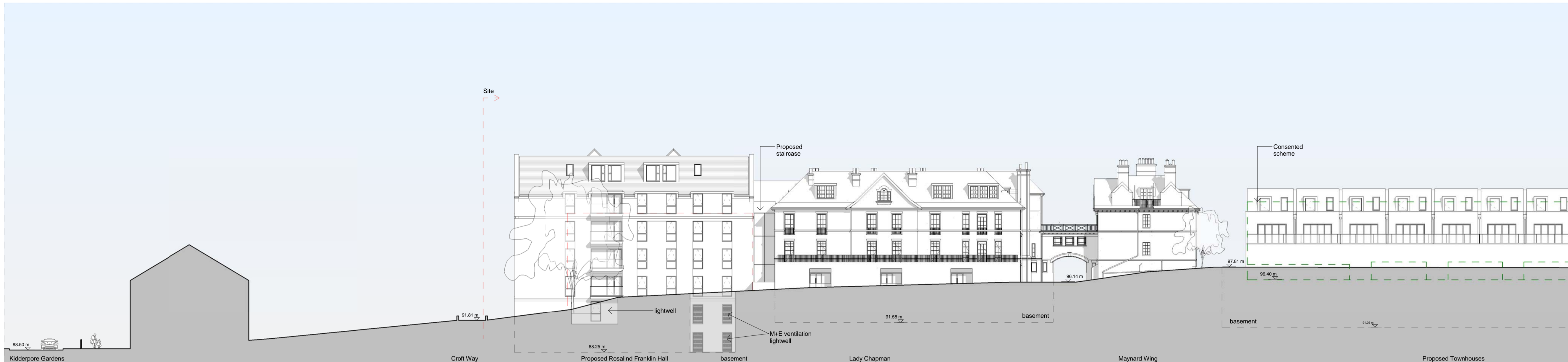
4 Eastern Side - Kidderpore Avenue North 1 : 250