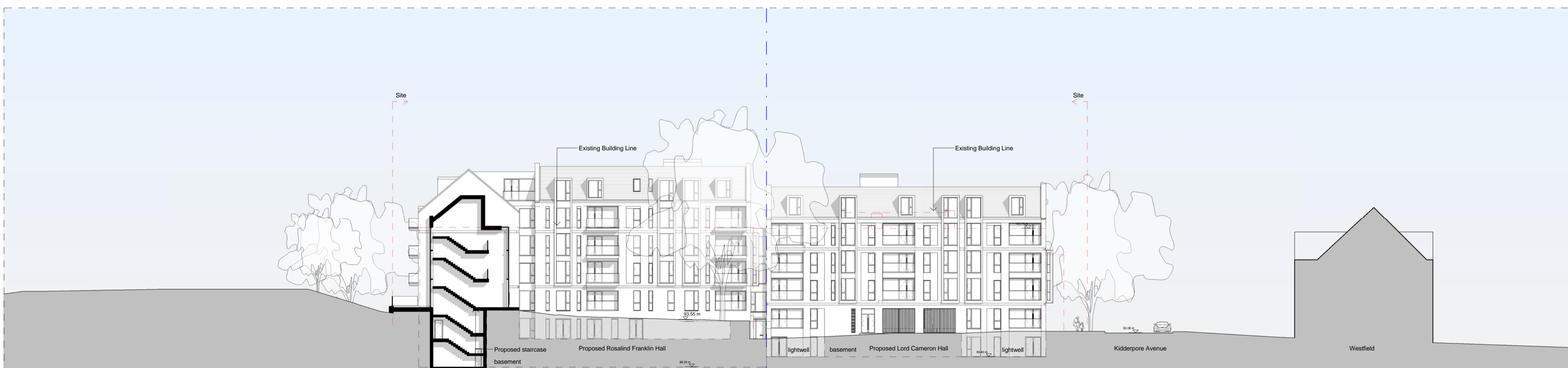
5 Eastern Side - Western Section 1 : 250