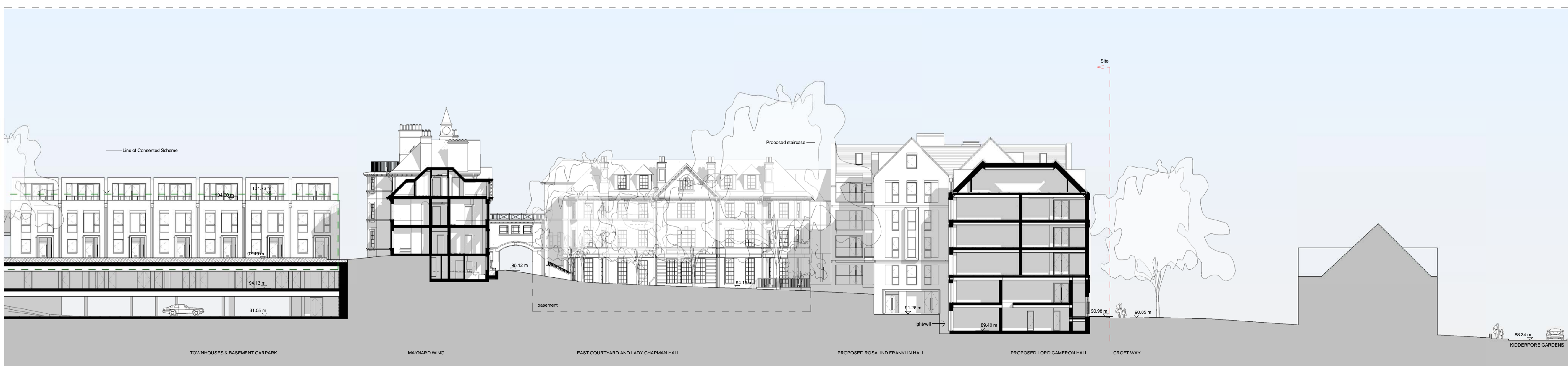
6 Eastern Side - North Section 1 : 250