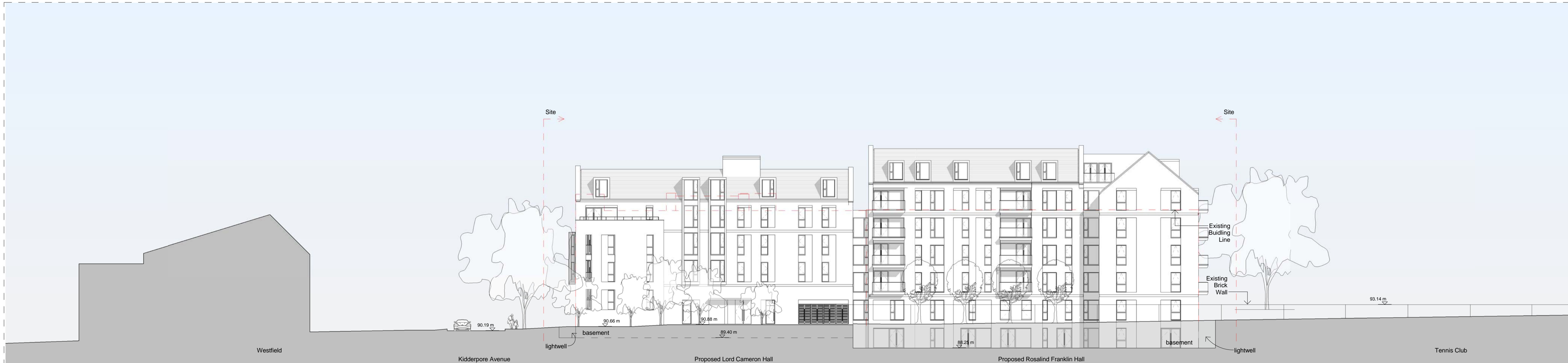
3 Eastern Side - Kidderpore Avenue East 1 : 250