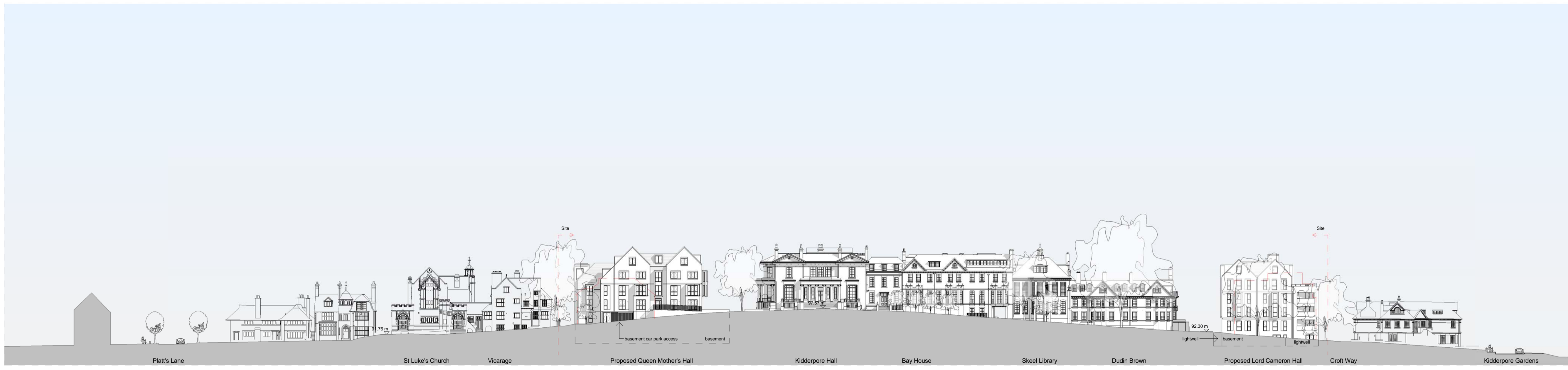
1 Kidderpore Avenue 1 : 500