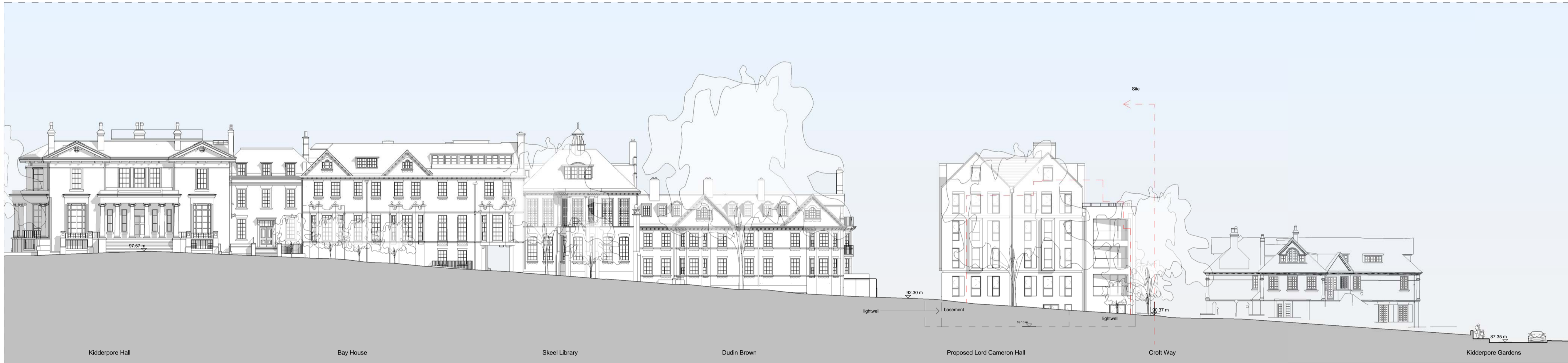
2 Eastern Side - Kidderpore Avenue South 1 : 250