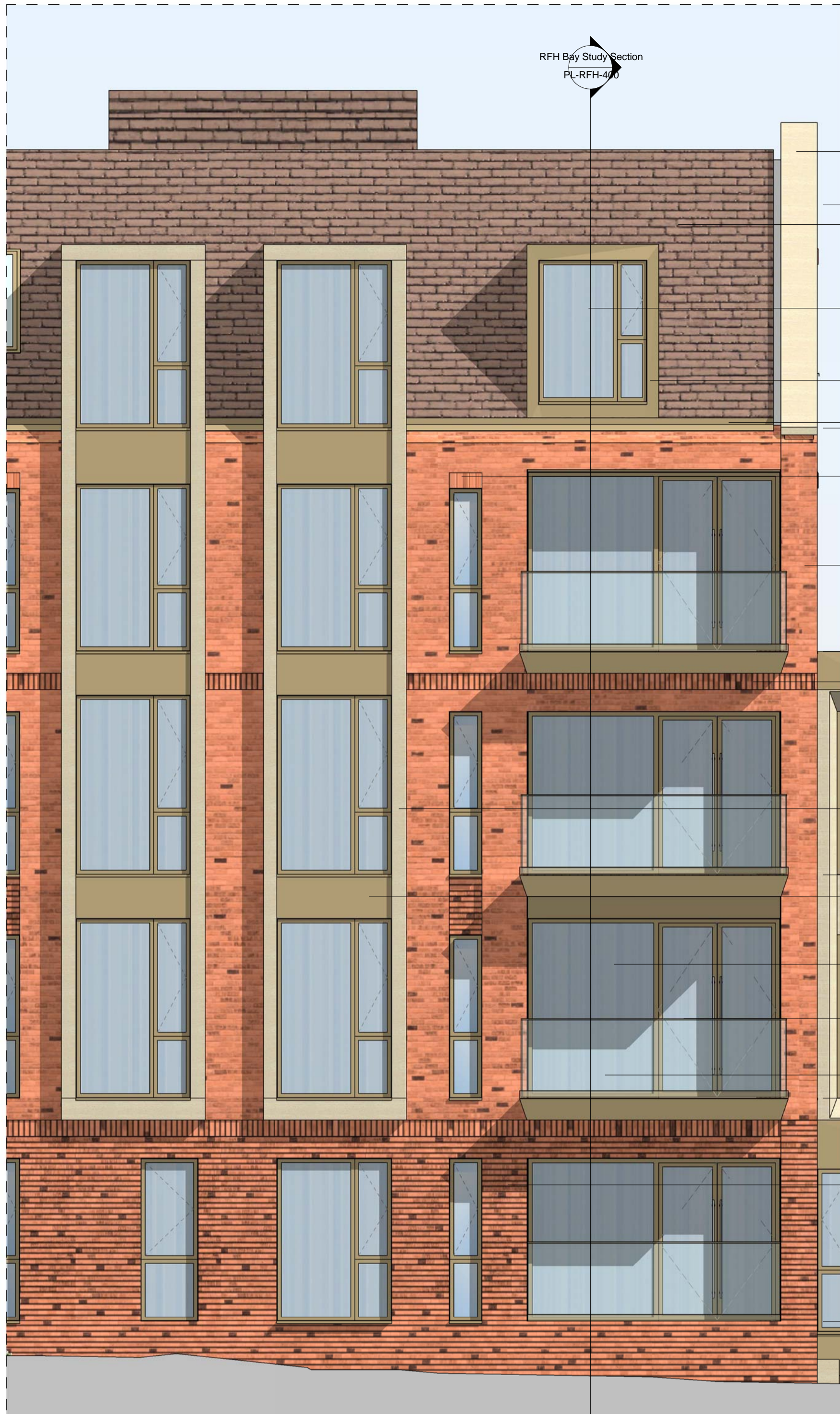
1 RFH West Bay Study Elevation 1 : 50