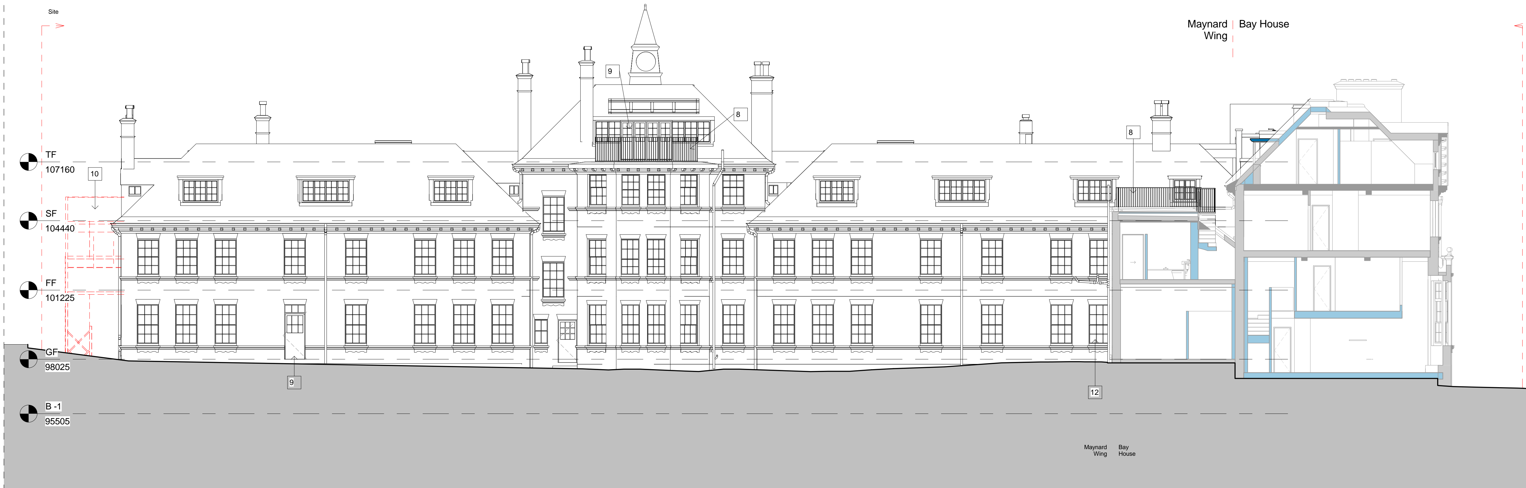
1 Proposed View of North-West Elevation 1 : 100

For detailed notes on listed buildings refer to listed building application drawings Existing levels and dims shown on sections are taken from the survey information provided by others. Proposed levels and floor to ceiling heights may be subject to change as detail design progresses. Assumptions have been made for party walls thicknesses and may be subject to change as detail design progresses. No allowance has been made at this stage for thermal lining of external walls of existing buildings. If required this may affect GIAs as detail design progresses.