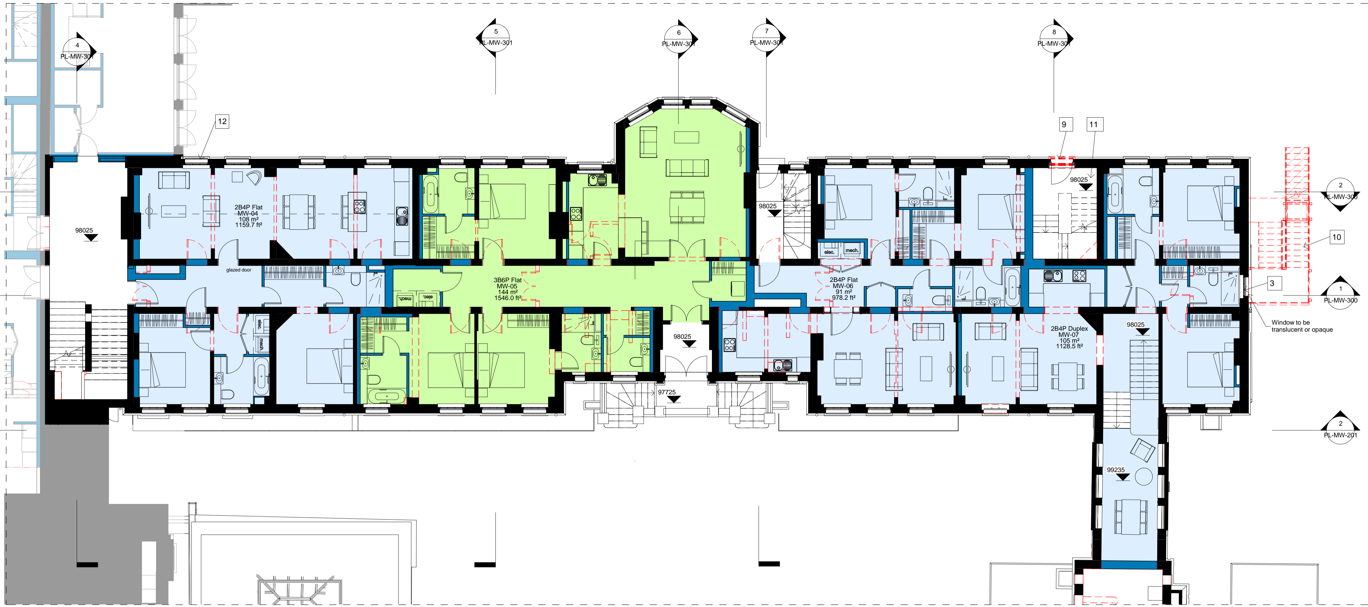
2 Proposed Upper Ground Floor Plan 1 : 100