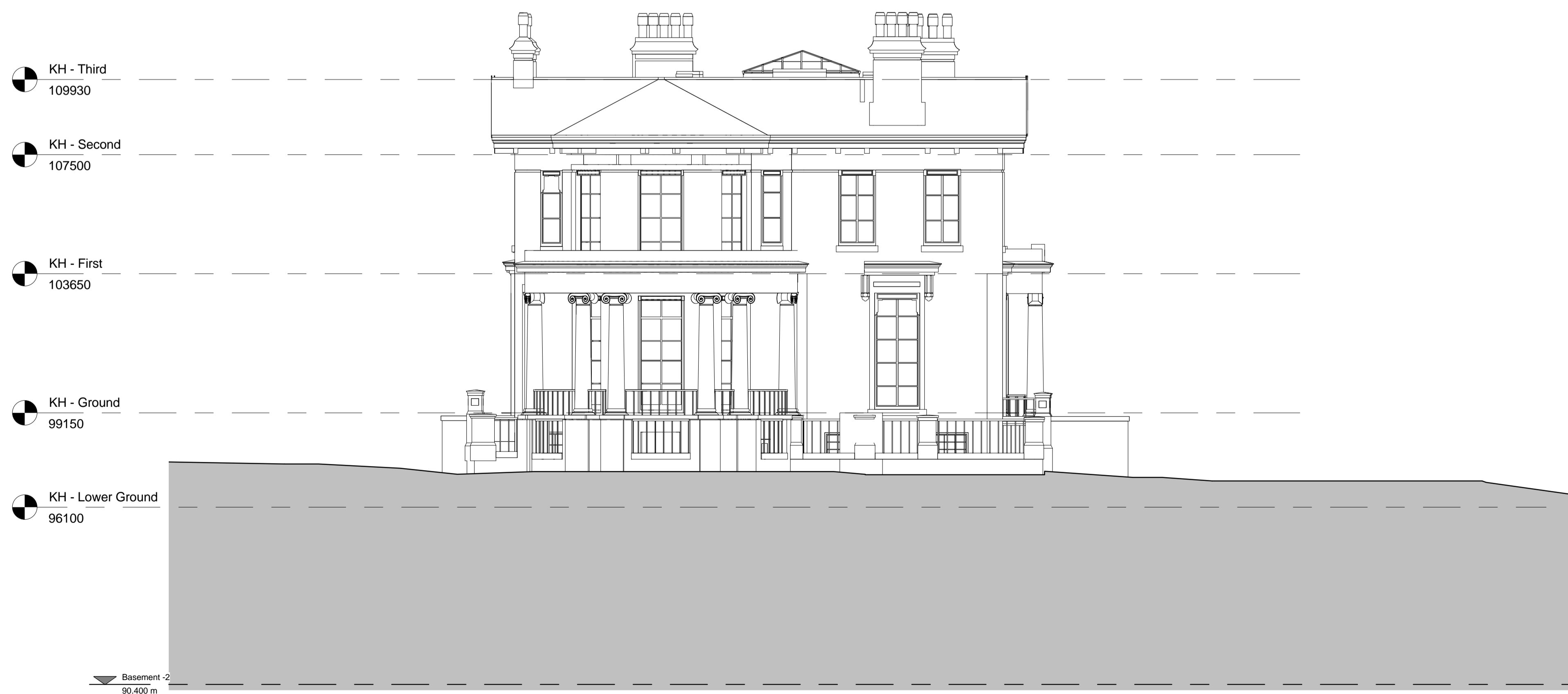
1 Existing North West Elevation 1 : 100