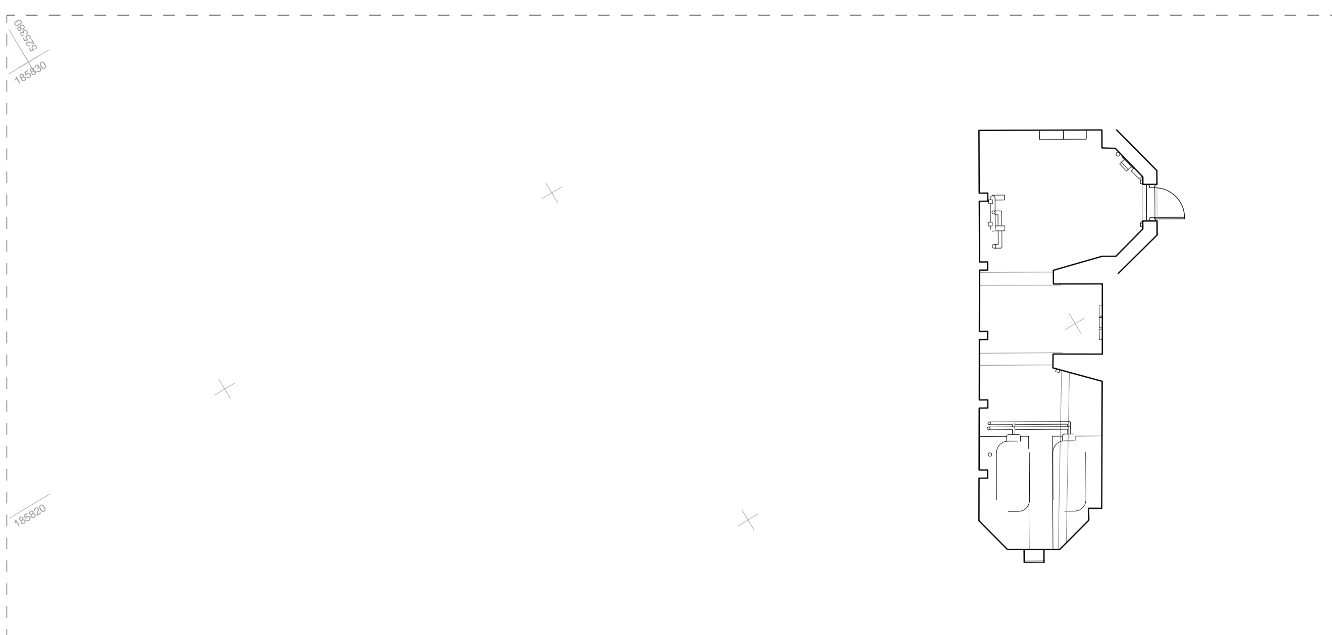
1 Existing Basement Floor Plan 1 : 100