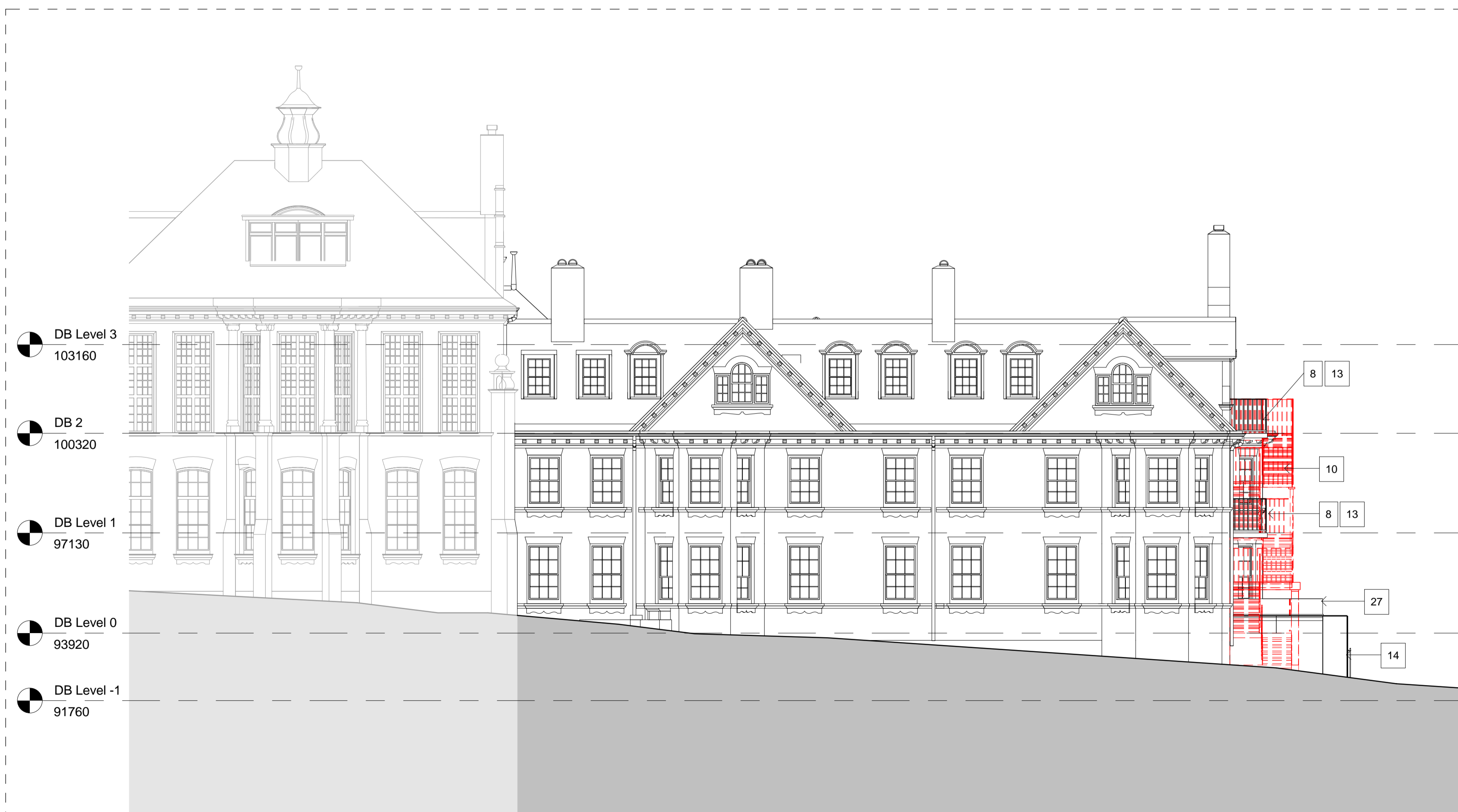
2 Proposed South West Elevation 1 : 100

LISTED AND EXISTING BUILDINGS For detailed notes on listed buildings refer to listed building application drawings Existing levels and dims shown on sections are taken from the survey information provided by others. Proposed levels and floor to ceiling heights may be subject to change as detail design progresses. Assumptions have been made for party walls thicknesses and may be subject to change as detail design progresses. No allowance has been made at this stage for thermal lining of external walls of existing buildings. If required this may affect GIAs as detail design progresses.