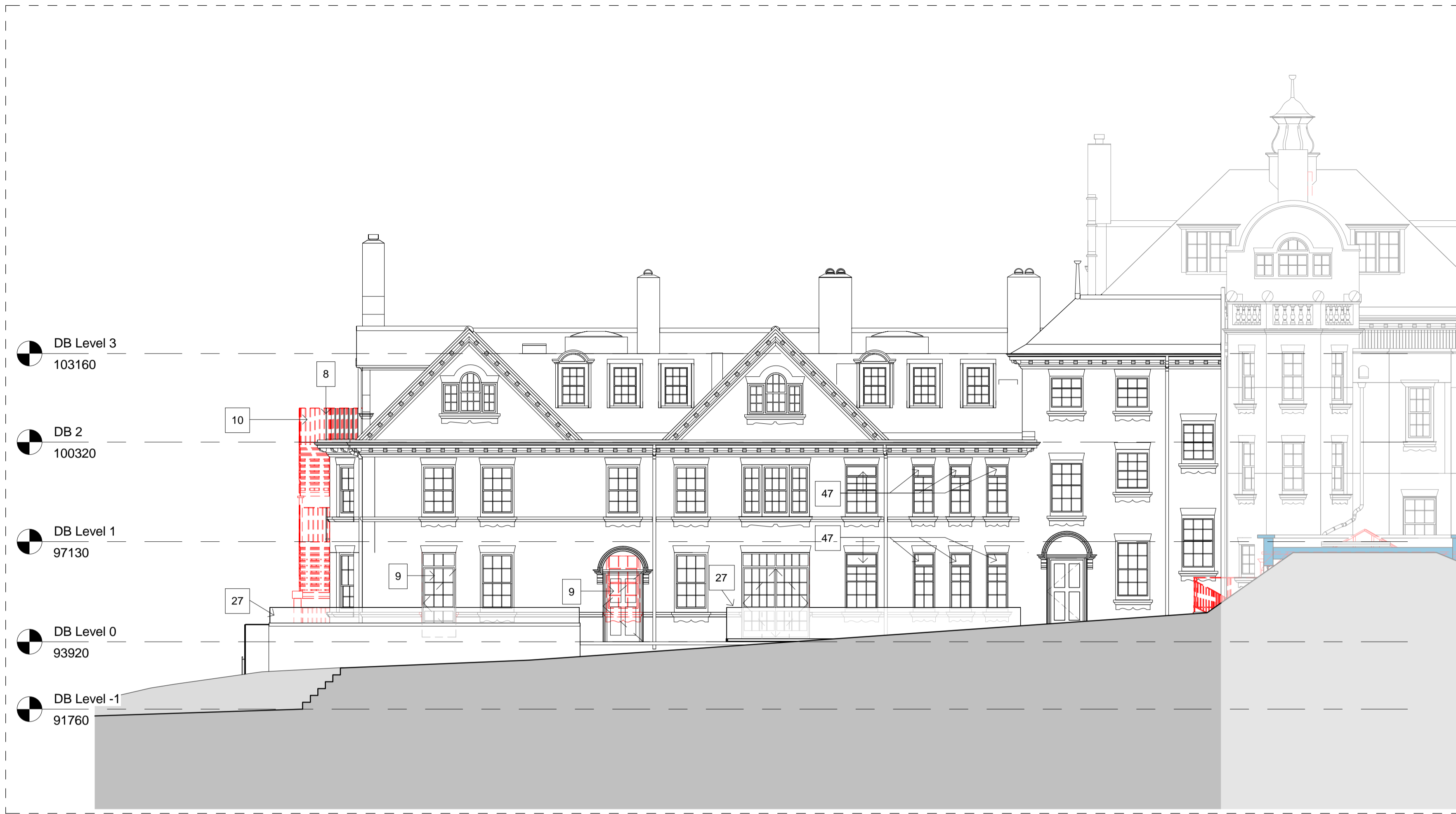
1 Proposed North East Elevation 1 : 100