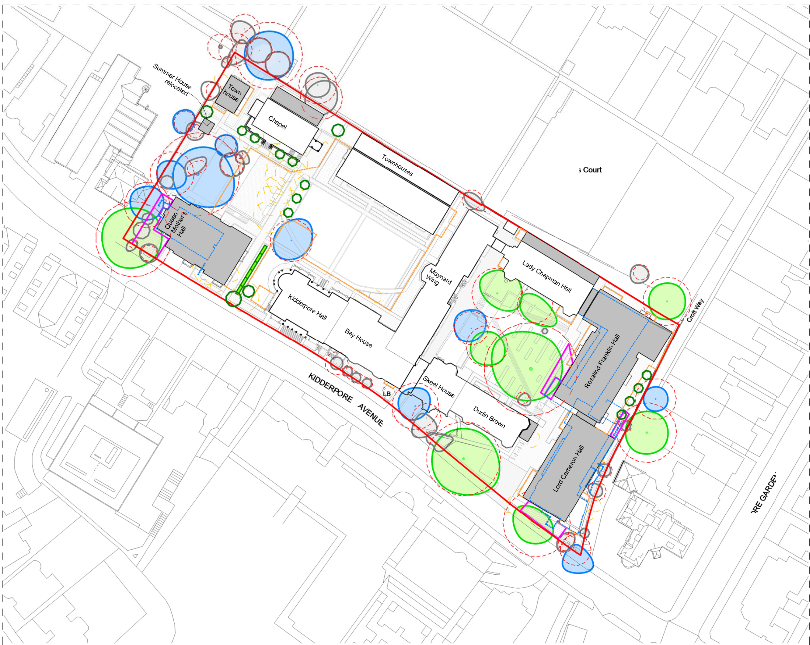
1 Diagram Trees 1 : 750