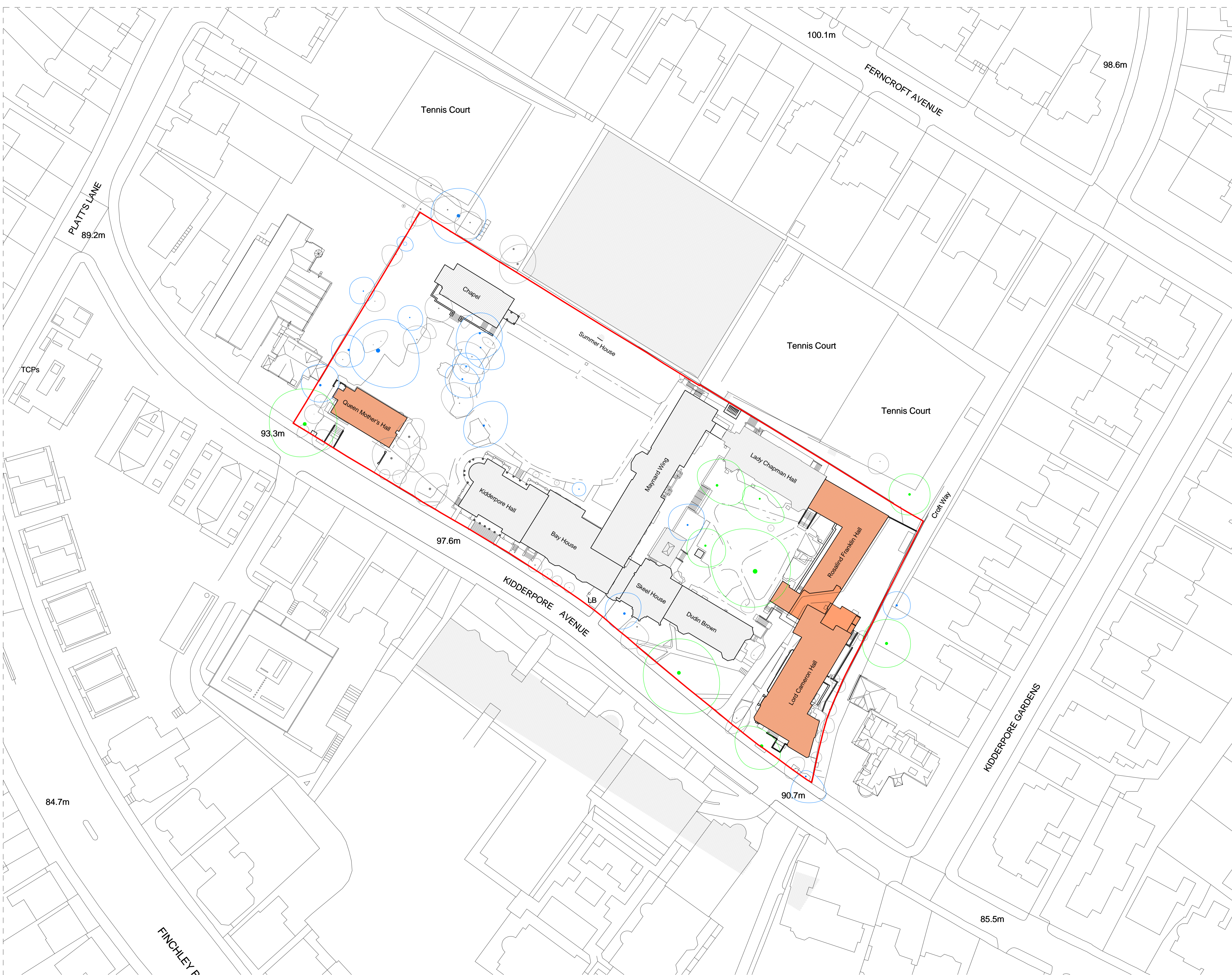
1 Site Plan - Existing Demolished 1:500