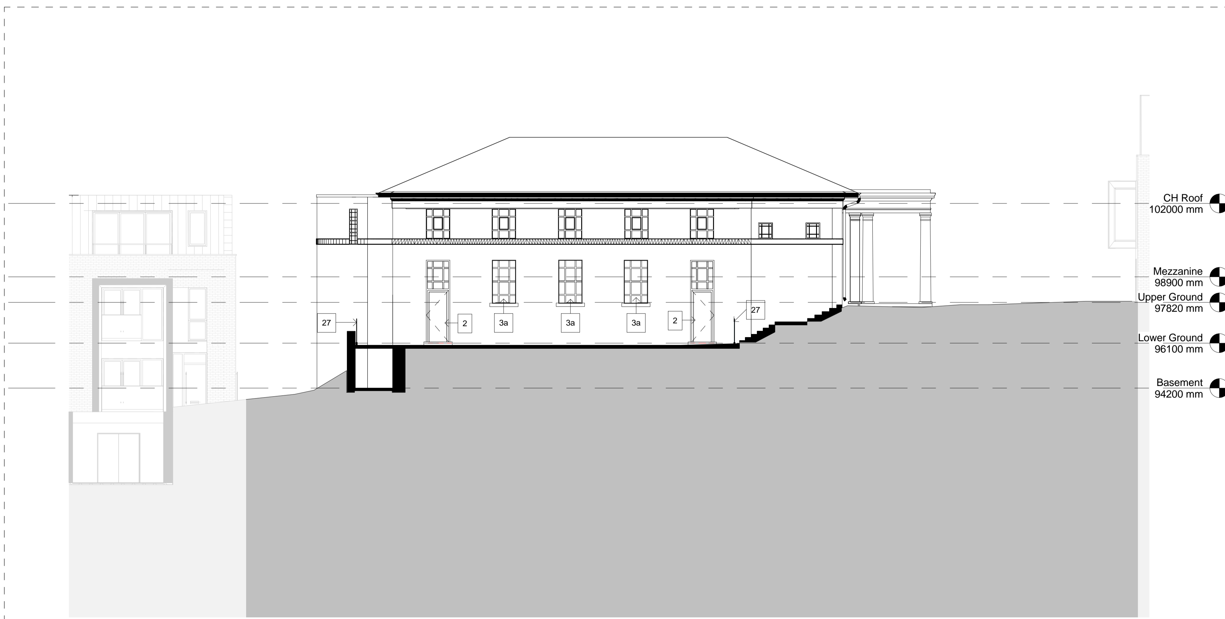
9 Section 9 1 : 100