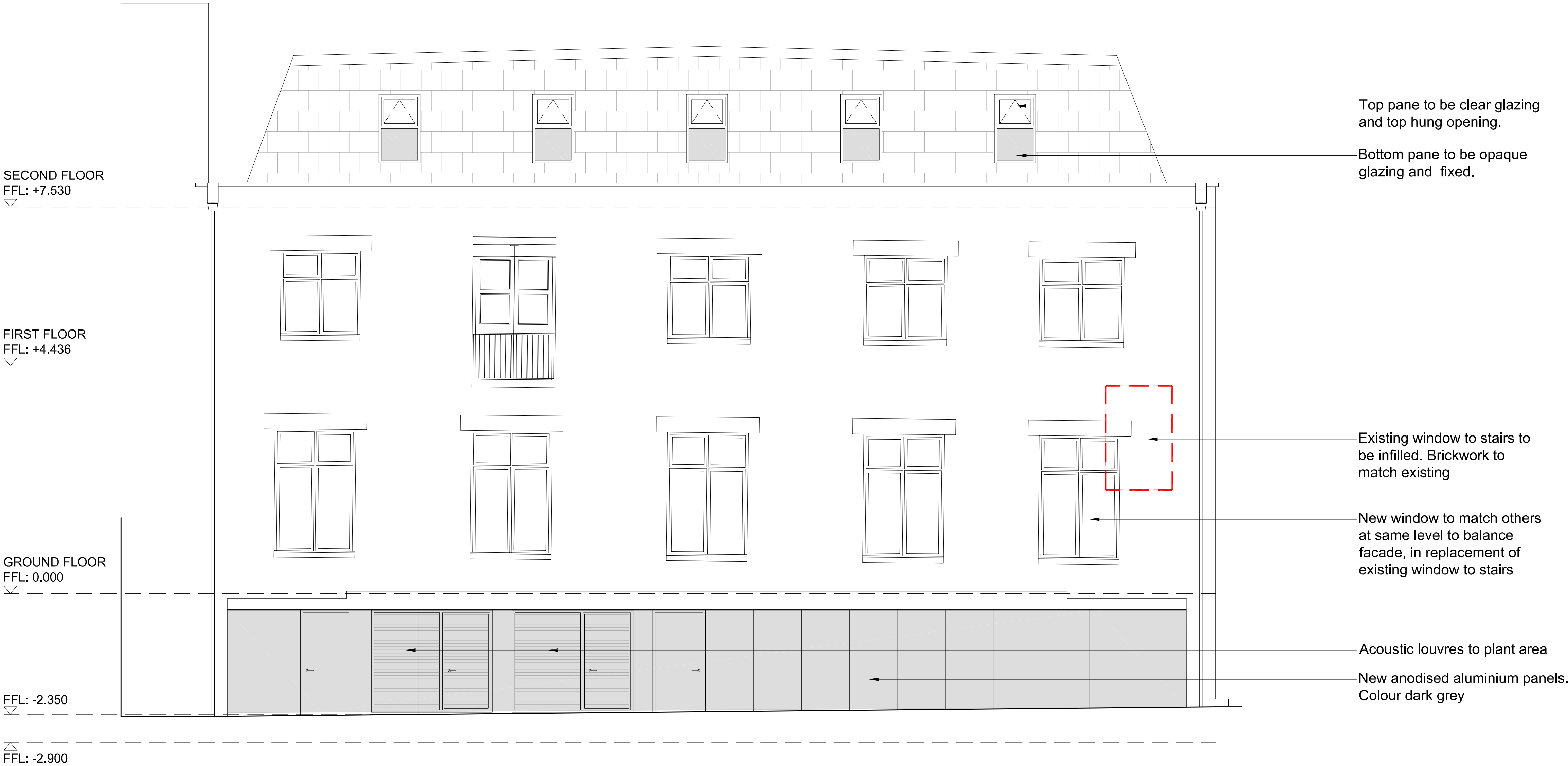
1 Proposed West Elevation SCALE 1:50 @ A1 / 1:100 @ A3