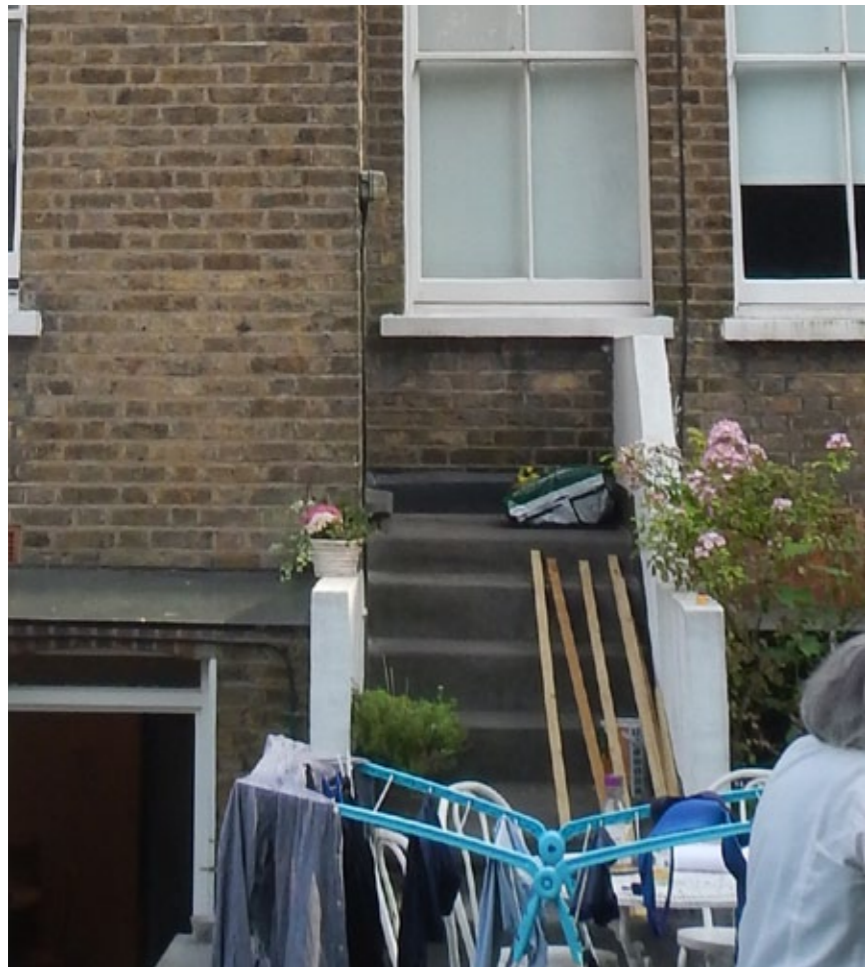
OLD STAIRCASE TO UPPER GROUND FLOOR