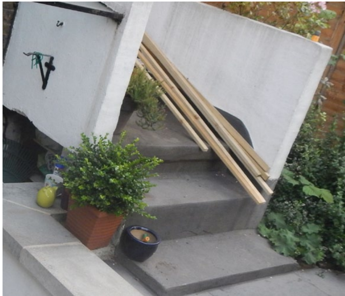
OLD STAIRCASE TO UPPER GROUND FLOOR