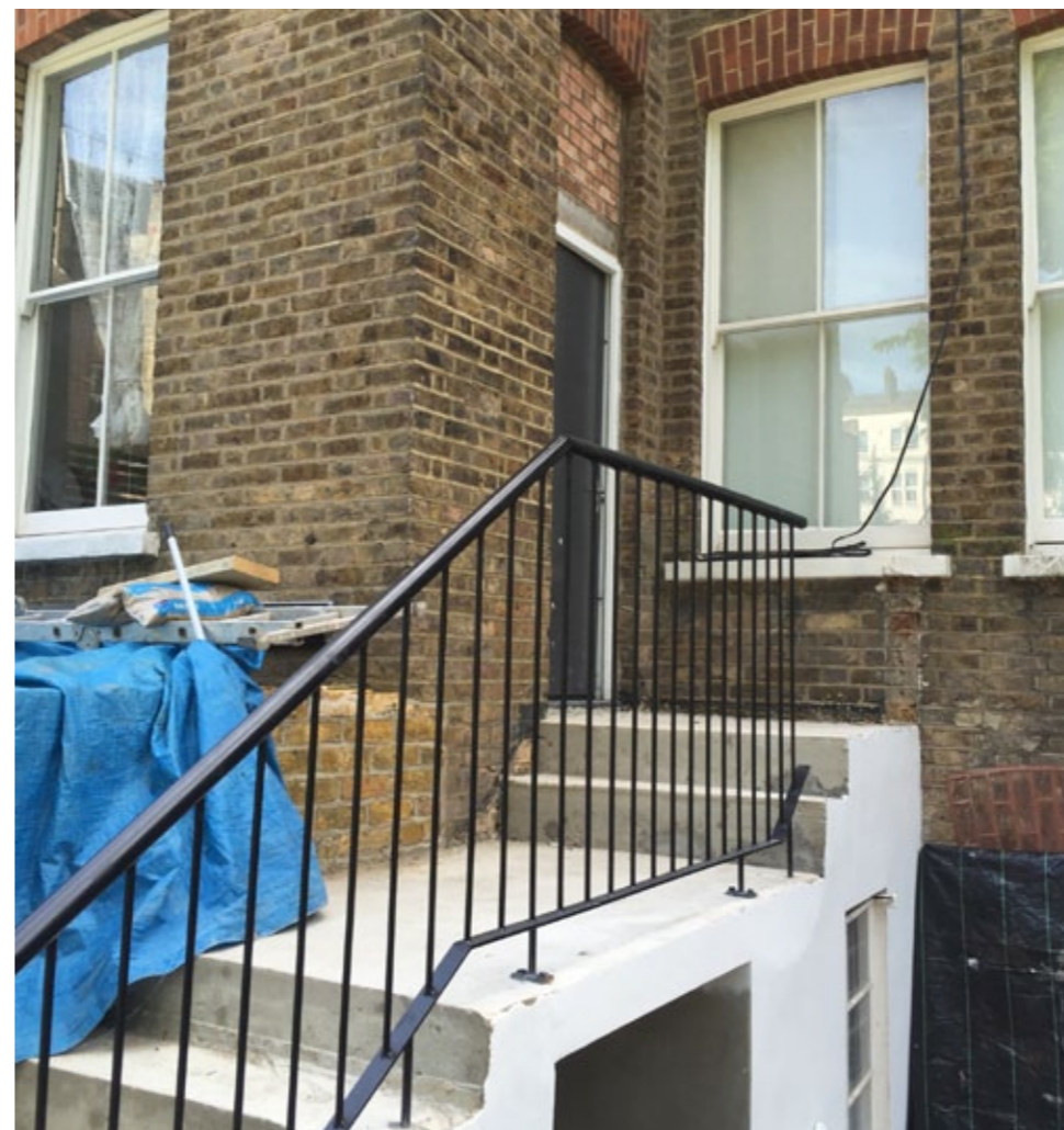
NEW METAL HANDRAIL (BUILDING REGS HIGHT)

PROJECT PROJECT Flat 1 8 Dennington Park Road West Hampstead NW6 1BA TITLE OLD AND CURRENT STAIRCASES ARCH Pietro Belli (ARB) 19B Lambolle Road London NW3 4HS m. +44 (0)7930474754 pietrobellidesign@gmail.com DATE JULY 2015 SCALE DRAWING No. 10C