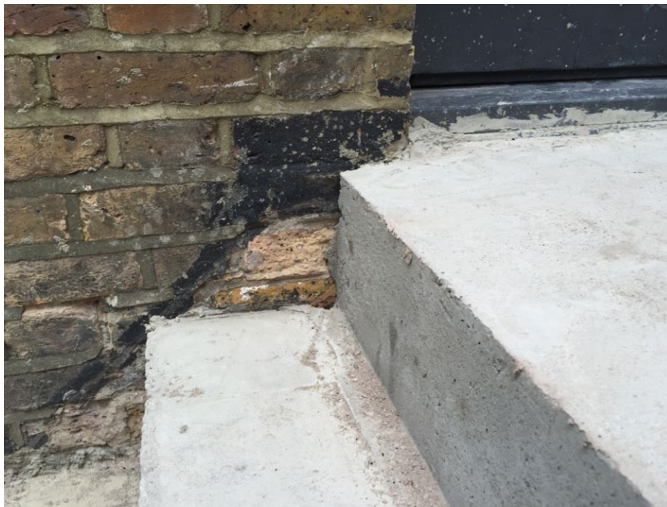
CURRENT LANDING RAISED BY 1.5 BRICK (100mm)