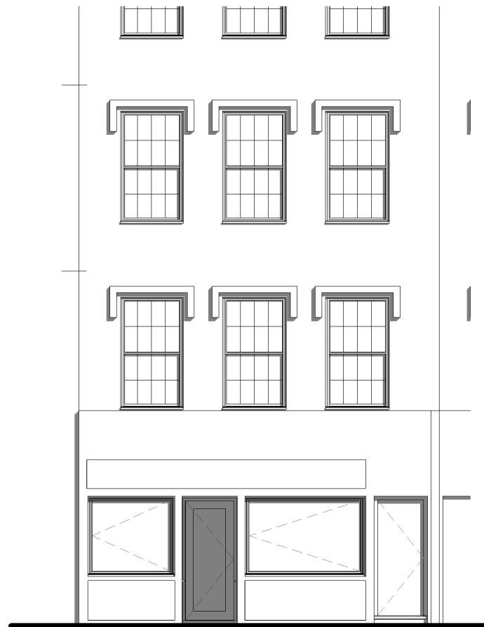
1 Existing Front Elevation. 1 : 100