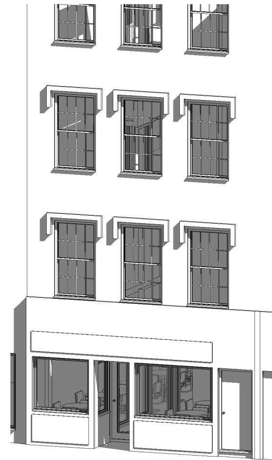
2 3D View.