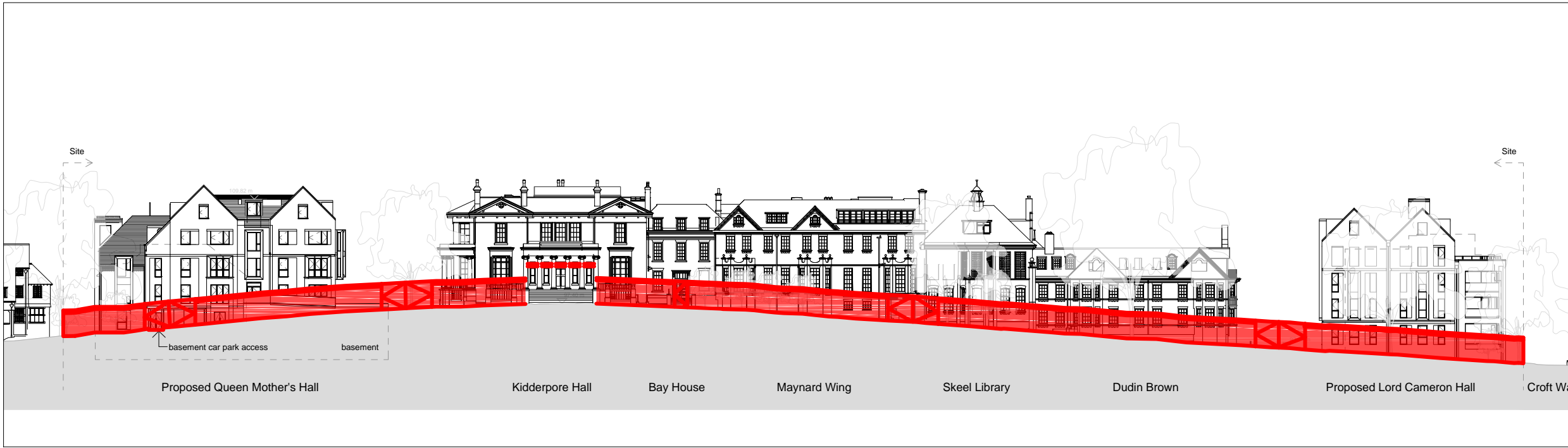
Kidderpore Avenue - Elevation 1 : 250