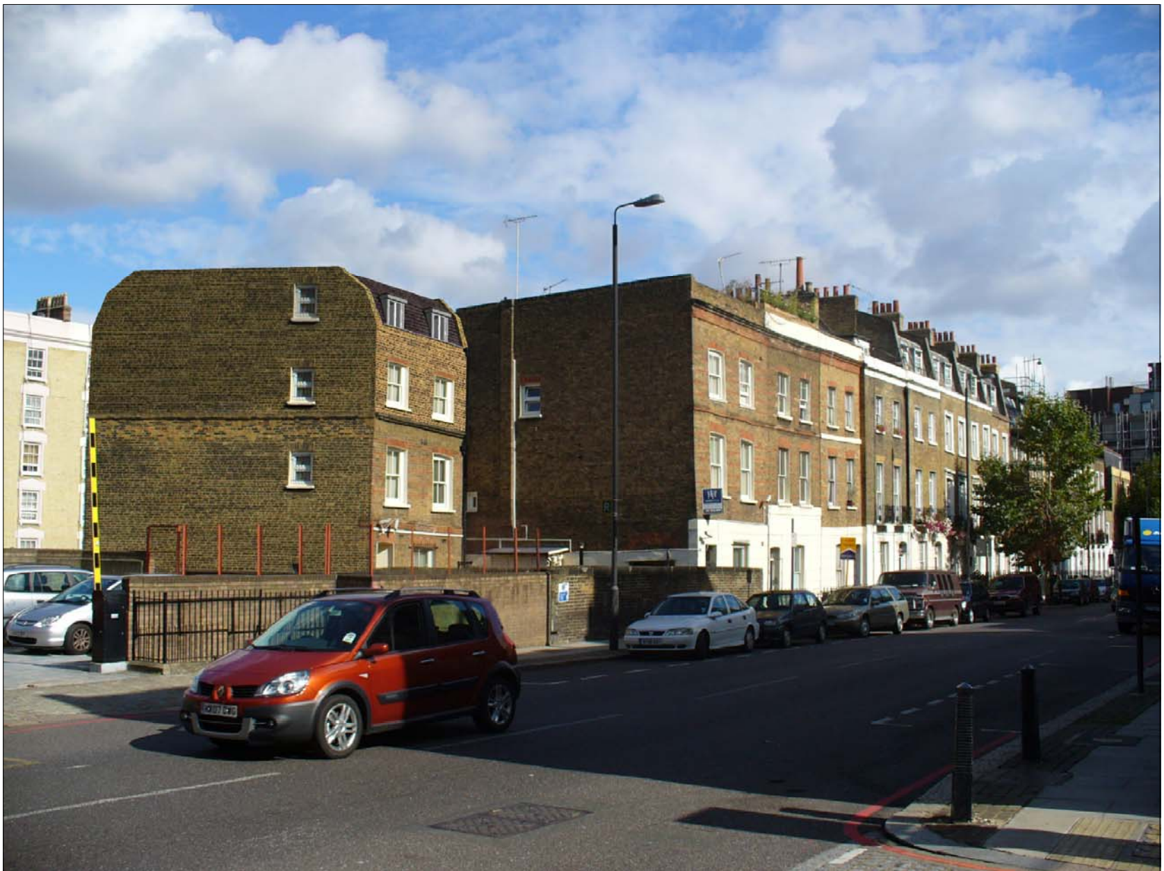
PROPOSED PERSPECTIVE VIEW