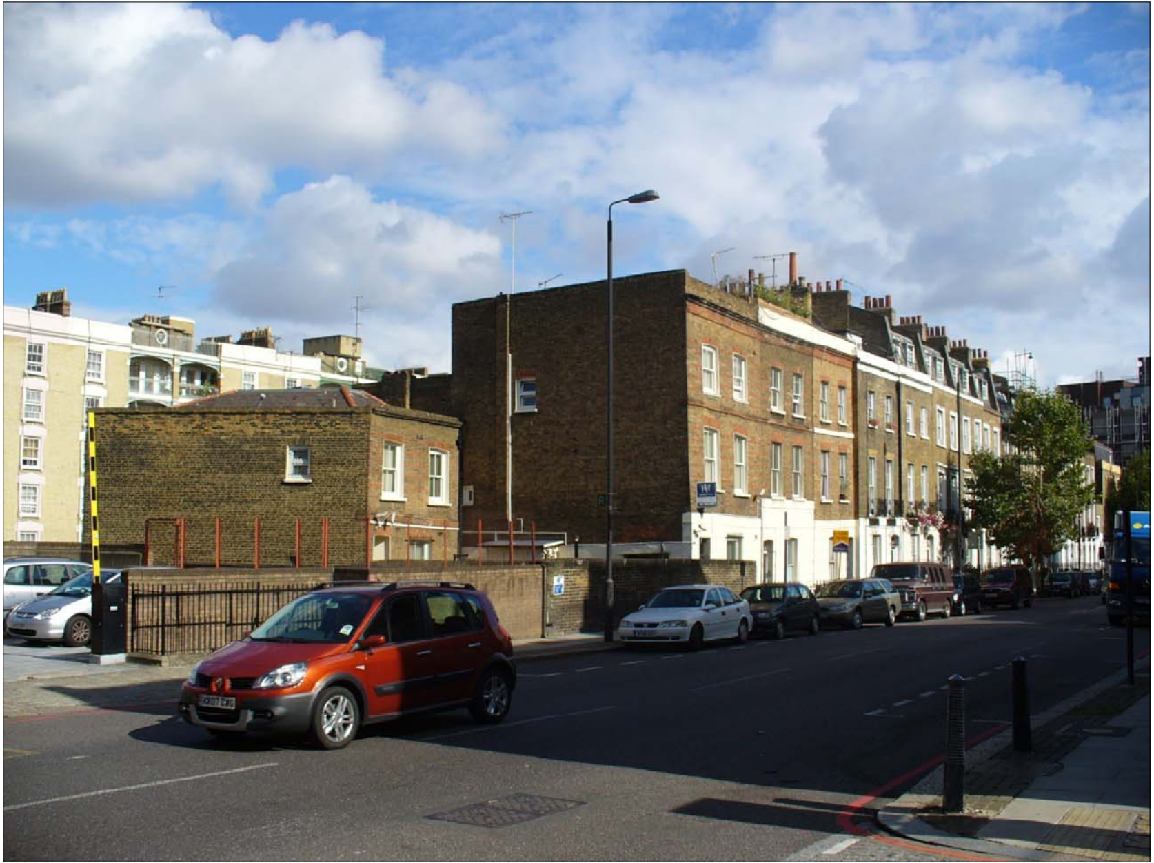
EXISTING PERSPECTIVE VIEW