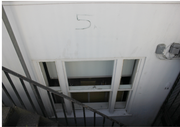
4 FRONT BASEMENT WINDOW 5A MORNINGTON CRESCENT