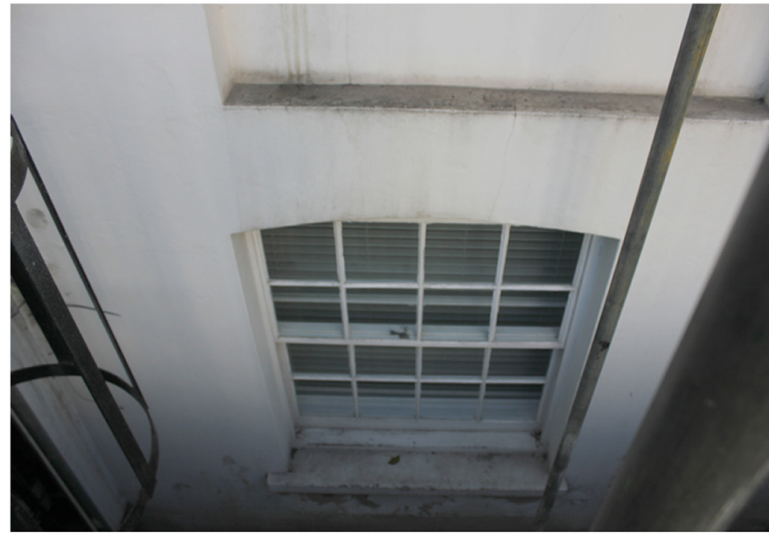
2 FRONT BASEMENT WINDOW 3A MORNINGTON CRESCENT