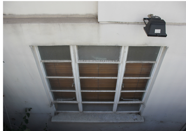
9 FRONT BASEMENT WINDOW 23A MORNINGTON CRESCENT