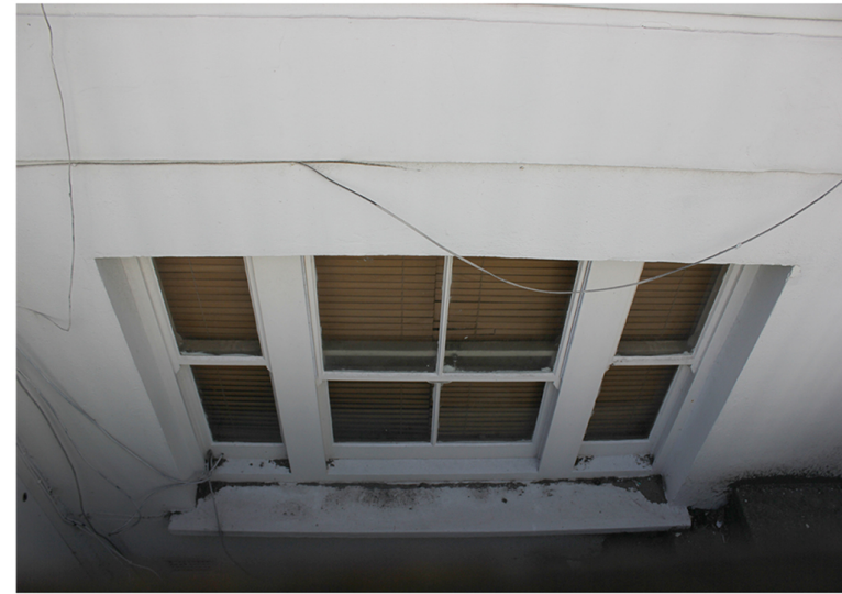
6 FRONT BASEMENT WINDOW 8A MORNINGTON CRESCENT