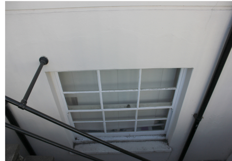
3 FRONT BASEMENT WINDOW 4A MORNINGTON CRESCENT