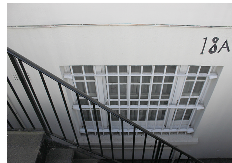
8 FRONT BASEMENT WINDOW 18A MORNINGTON CRESCENT