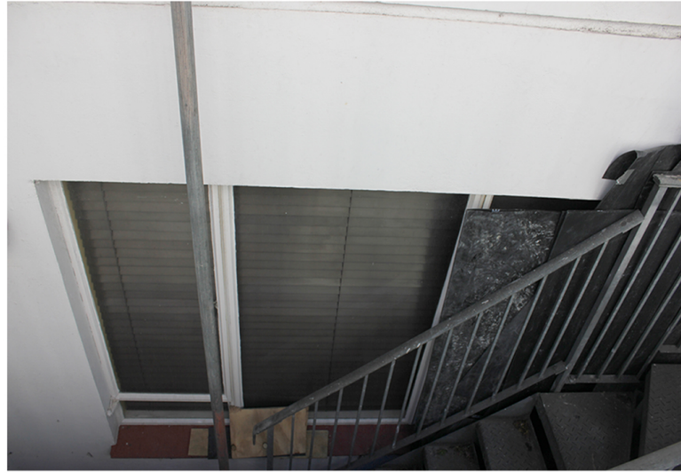
1 FRONT BASEMENT WINDOW 10A MORNINGTON CRESCENT (APPLICATION PROPERTY)