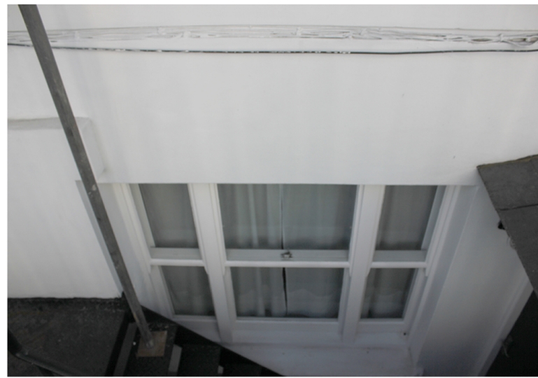
5 FRONT BASEMENT WINDOW 6A MORNINGTON CRESCENT