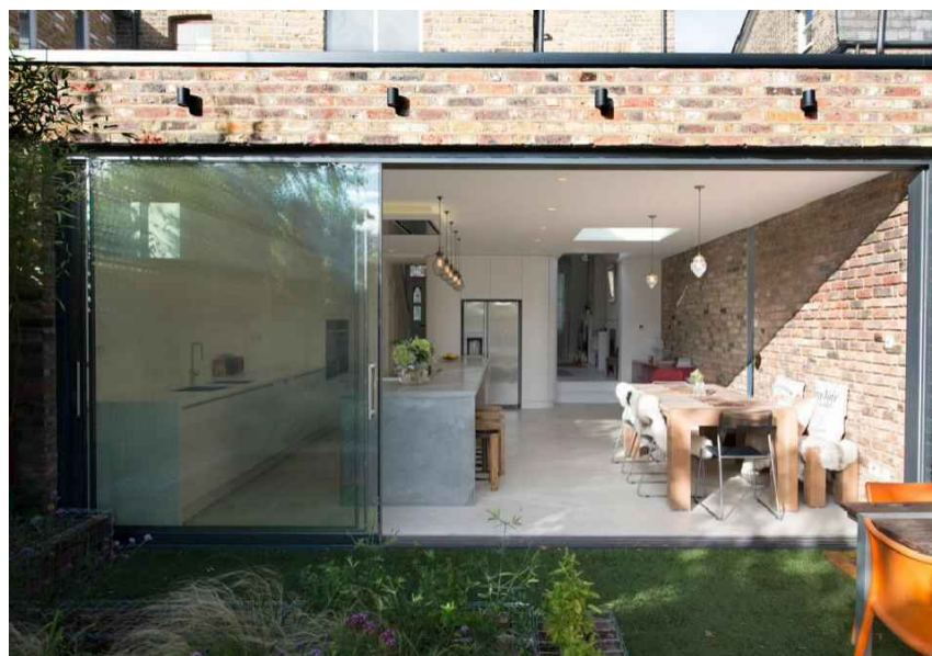
2 - Aluminium framed glazed sliding doors. (Lower Ground Floor) Image to illustrate glazed doors only.