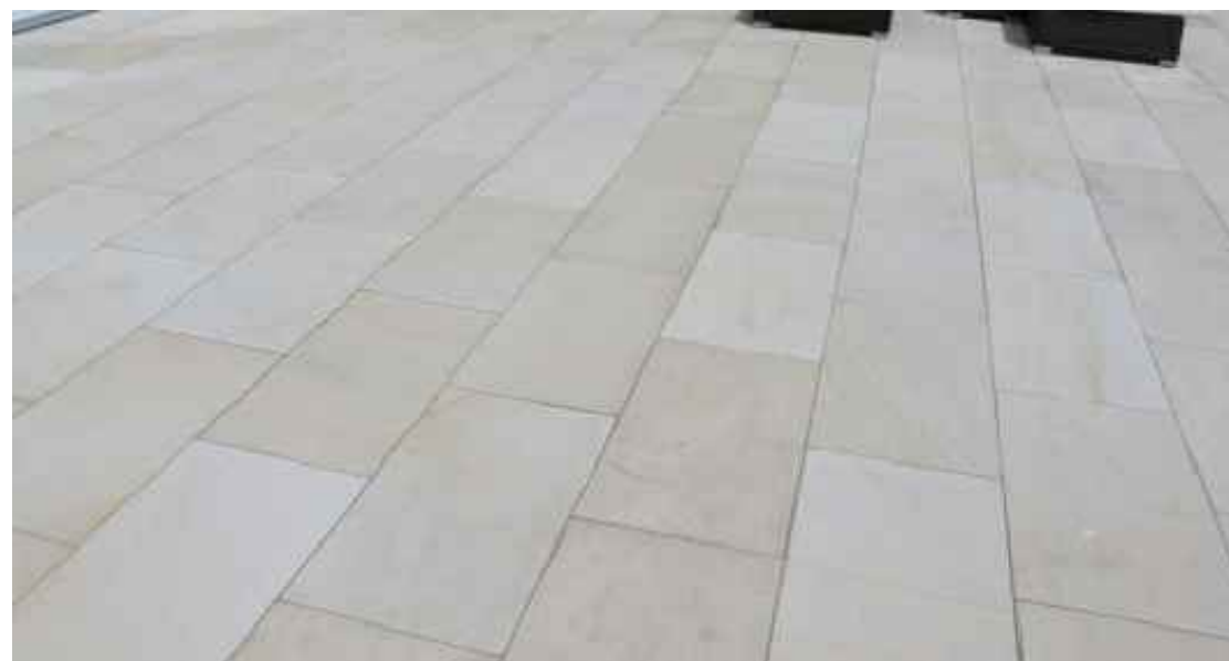
1 - Mountcharles Sandstone (Extension Roof Surface)