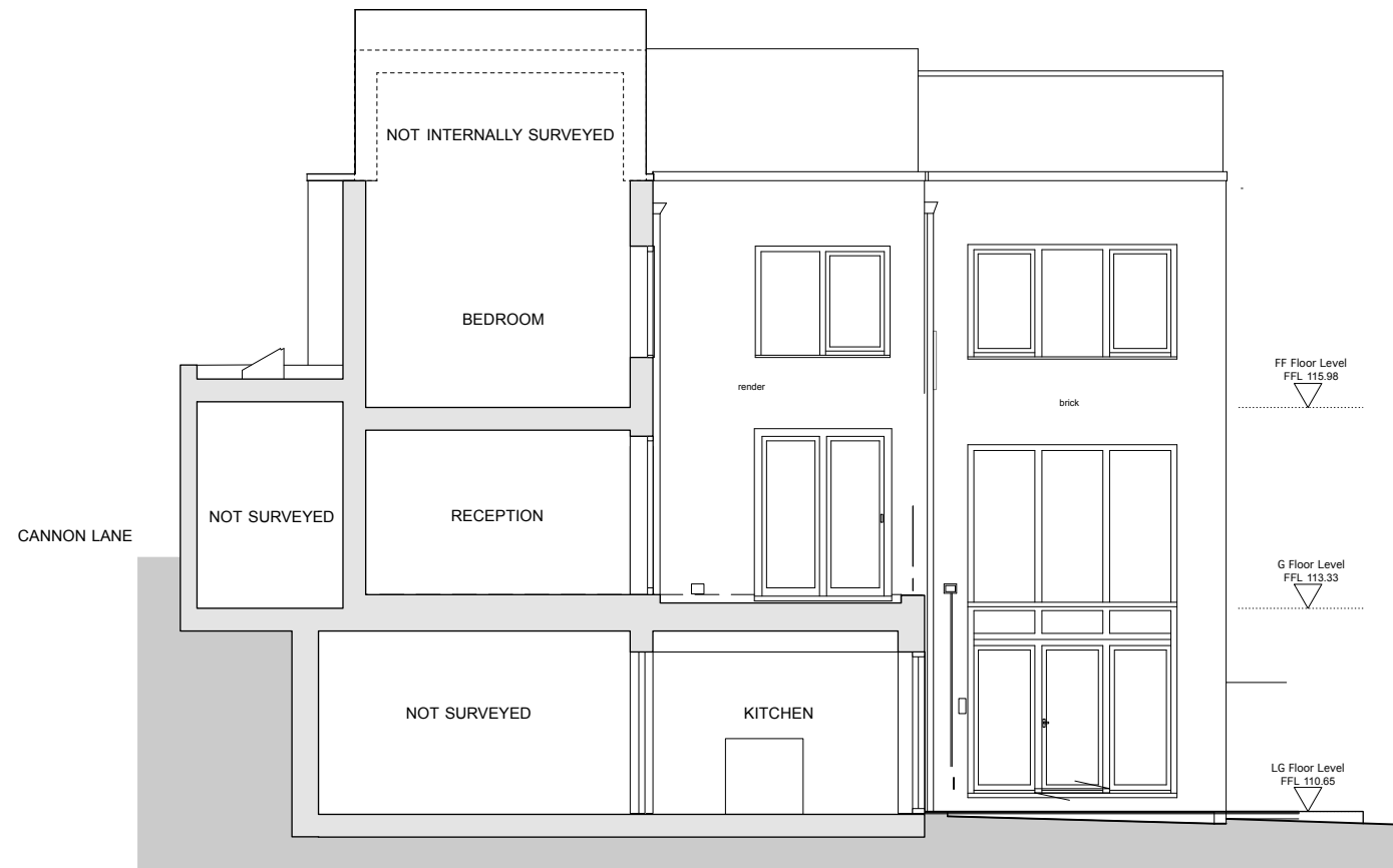
1 Existing Section A-A 1:50