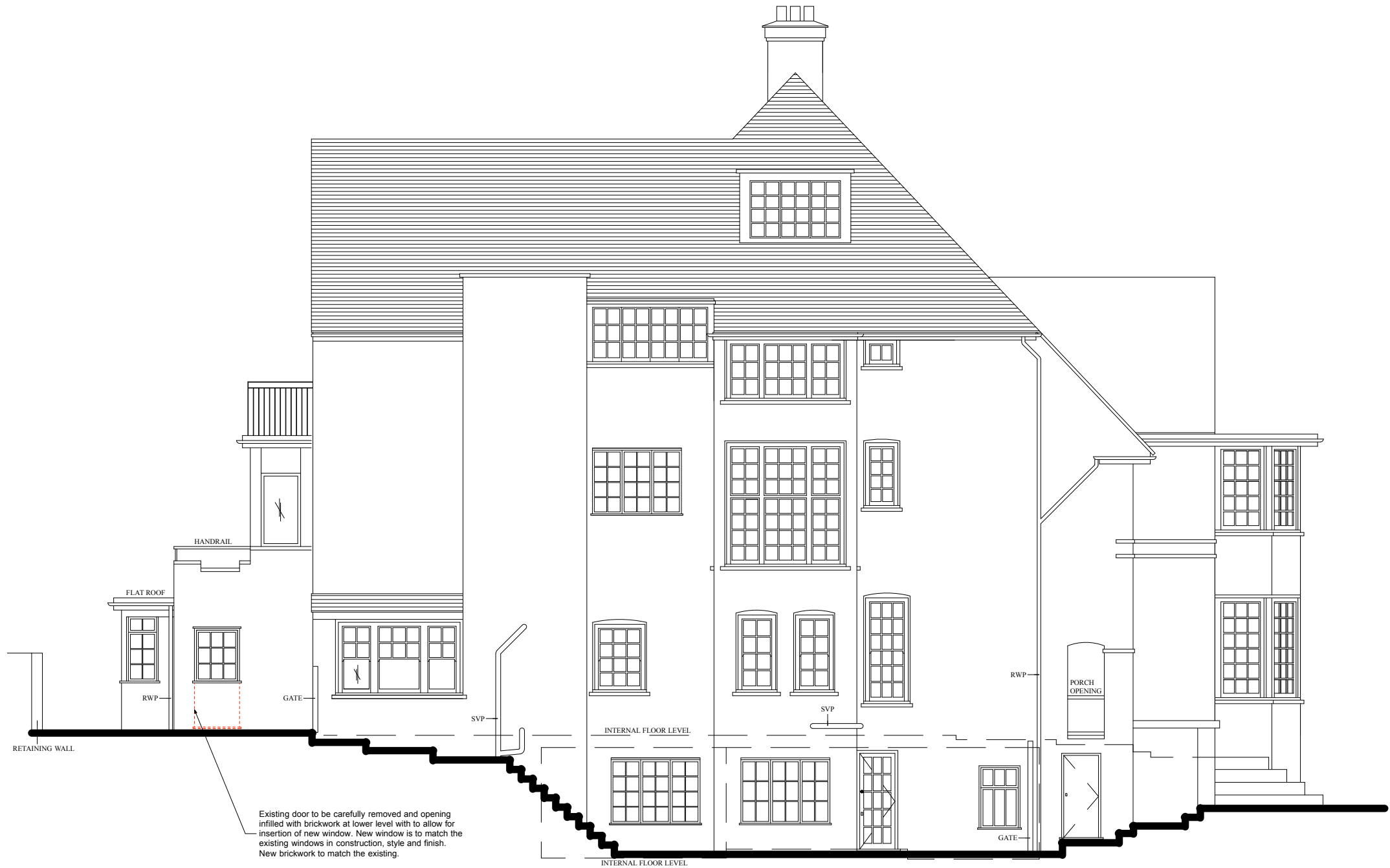
FLANK ELEVATION AT 'A'