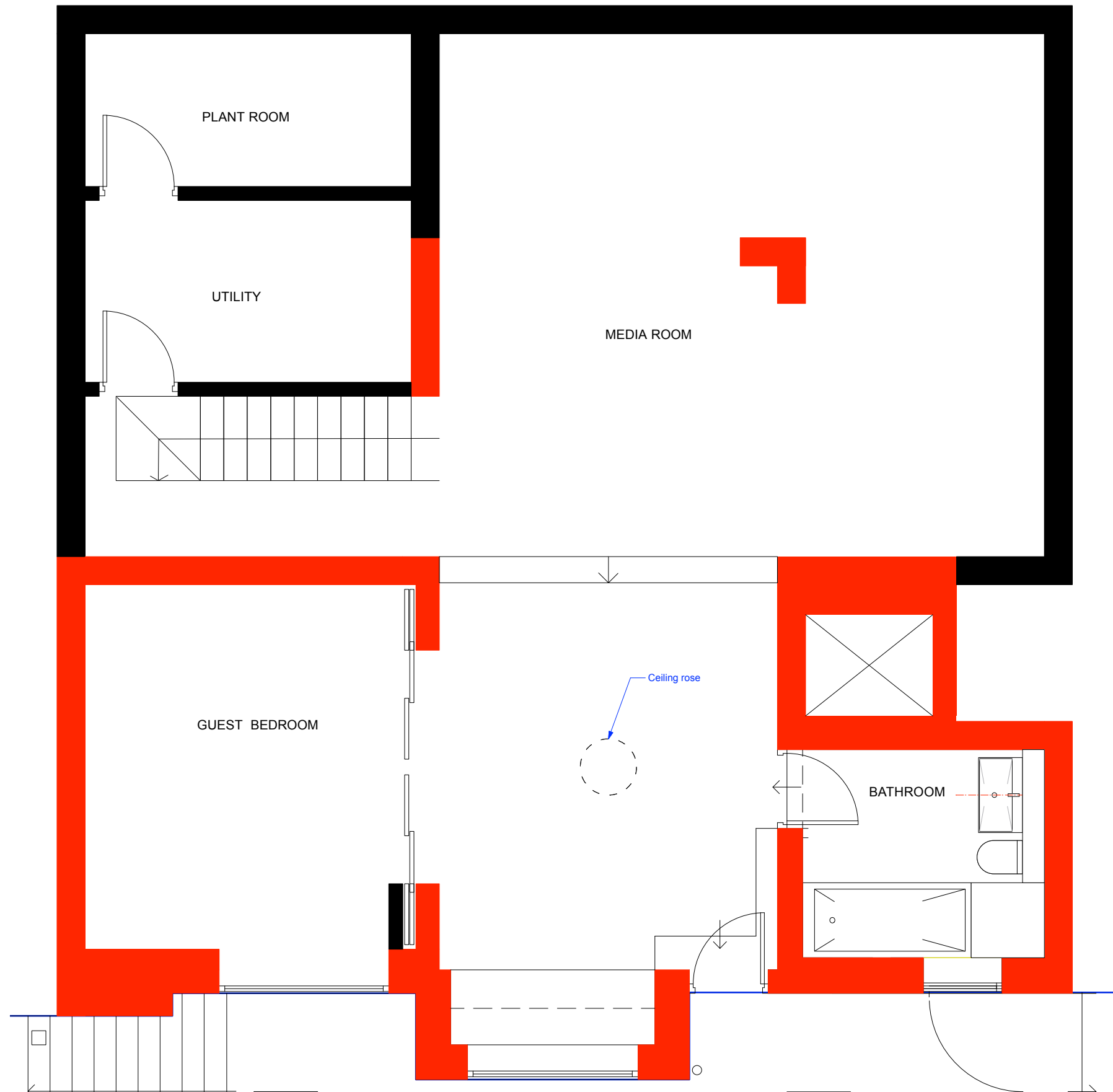
1 PLAN Scale: 1:25