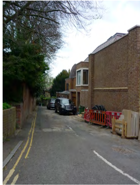
1. View looking East down Cannon Lane (No changes proposed)