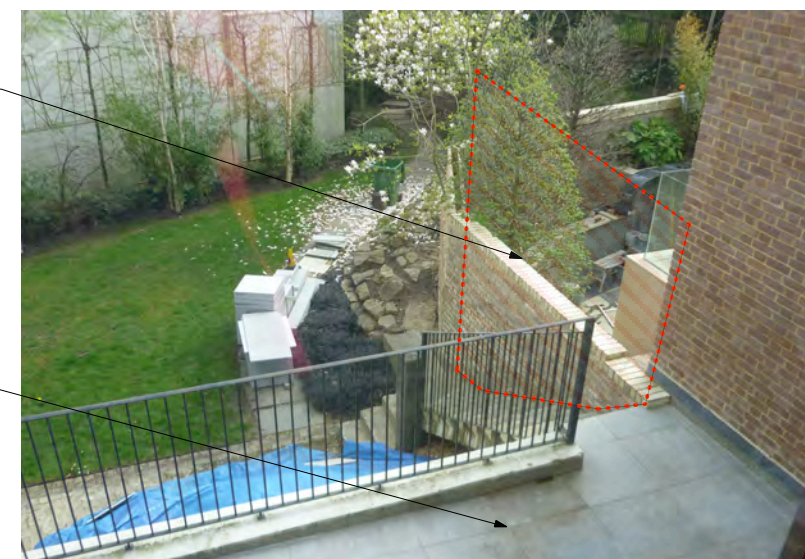
10. View from First Floor over garden and boundary wall.