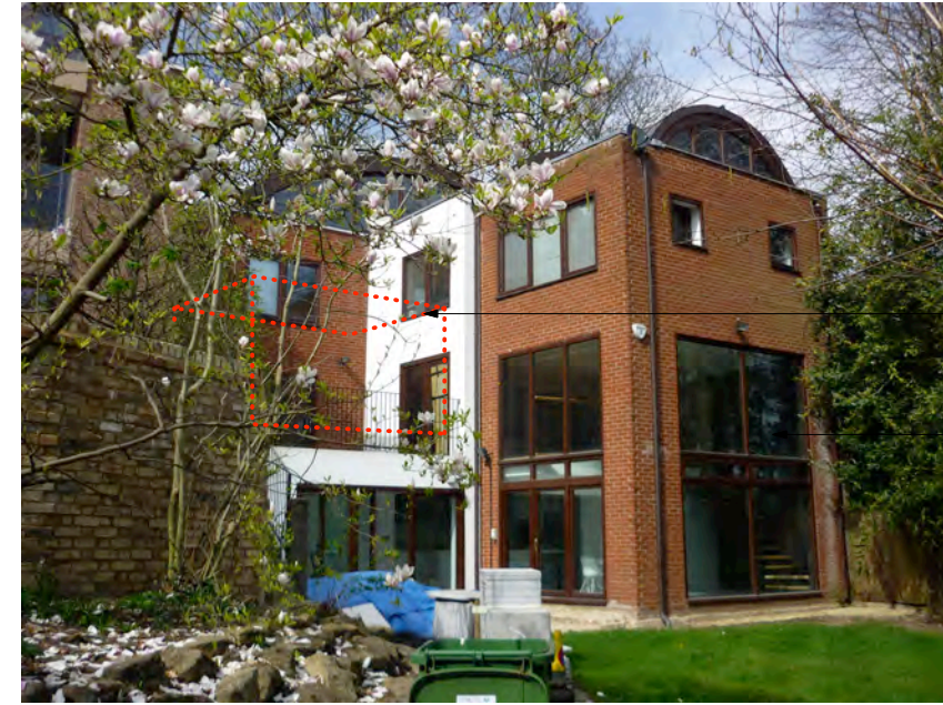
3. Rear view of property

Front door to be replaced with powdercoated metal to match windows. Window to be replaced with powder coated metal frame. Reveal to be increased to improve weathering.