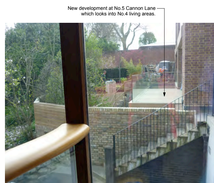
6. View from inside No. 4 shows newly built adjacent property overlooking into No. 4. Screening proposed within the boundary of No. 4 along the staircase to minimise overlooking and aid security.

Proposed location of new single storey extension