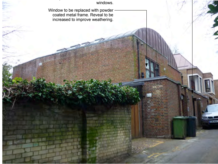
2. Streetside view of property

Front door to be replaced with powdercoated metal to match windows. Window to be replaced with powder coated metal frame. Reveal to be increased to improve weathering.