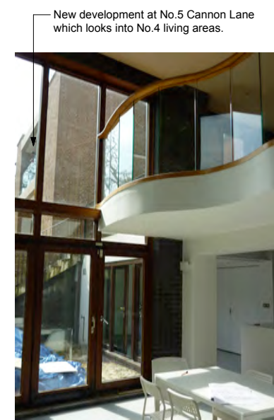
8. Dining room view to the terrace

Proposed location of privacy screen will also act as additional balustrade to the balcony