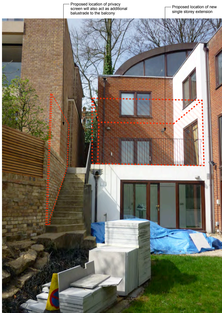
5. Existing terrace at ground floor level. Proposals create a single storey extension with terrace recreated at first floor level.

Windows to be replaced with powder coated metal frame, recess to give frameless aesthetic. Reveal to be increased to improve weathering.