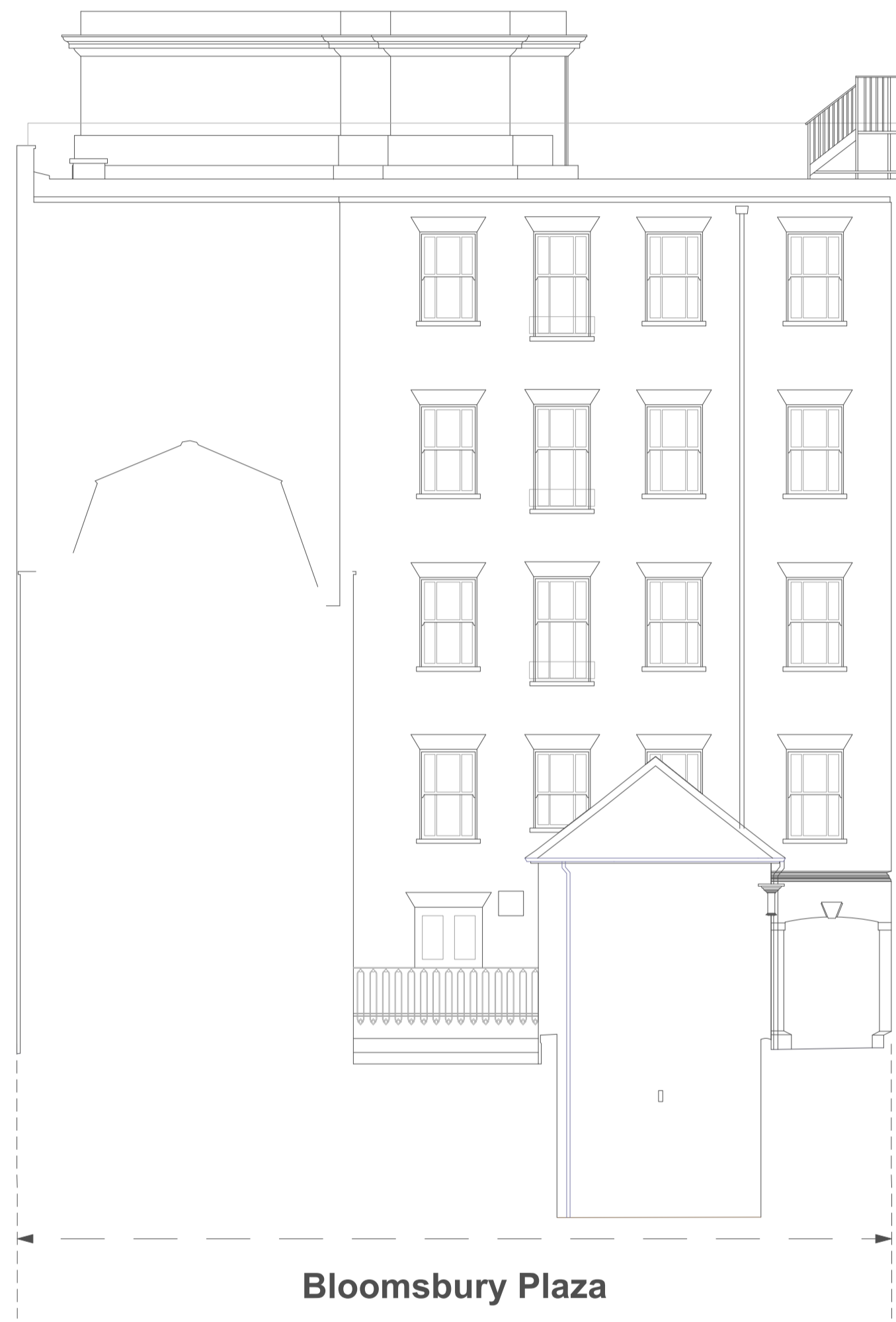
2 Existing Courtyard North Elevation 1:100 at A1