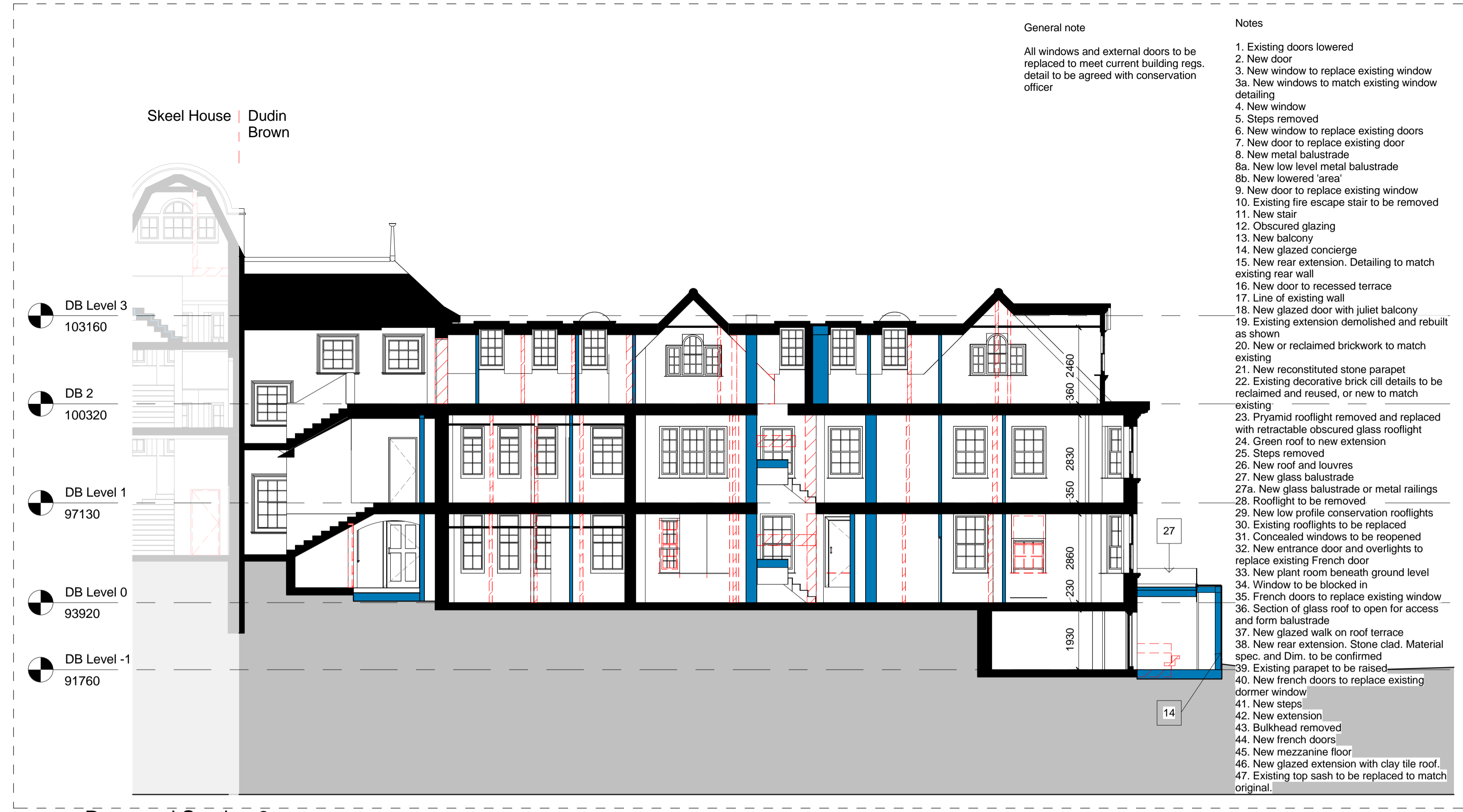
3 Proposed Section 3 1 : 100