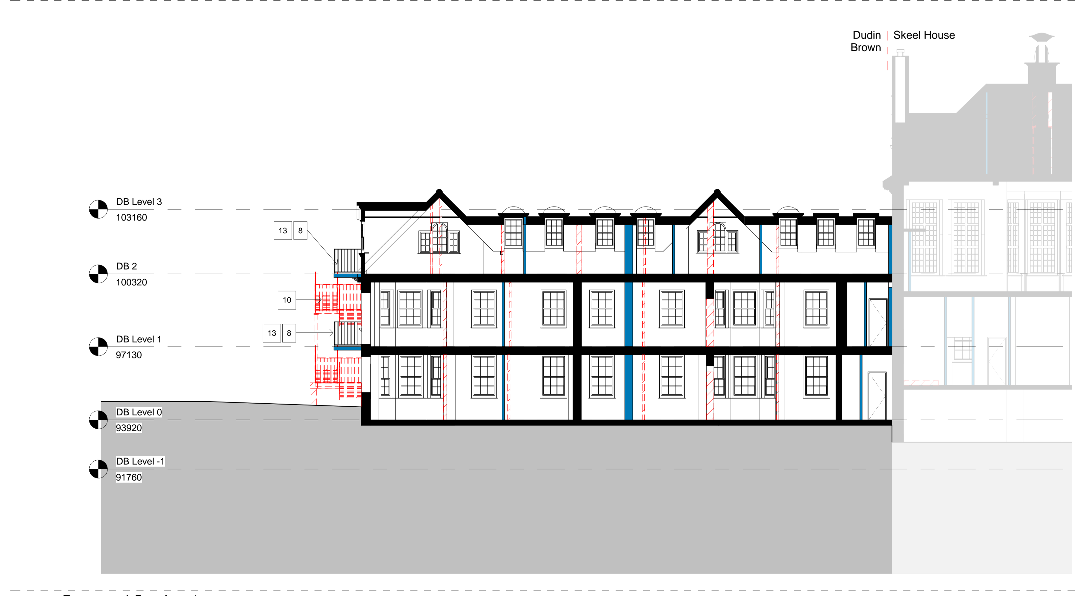
4 Proposed Section 4 1 : 100