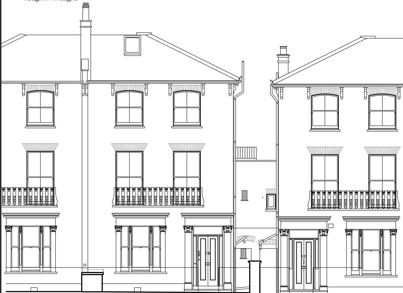
01 Existing West Elevation 1:50@ A1 / 1:100@A3