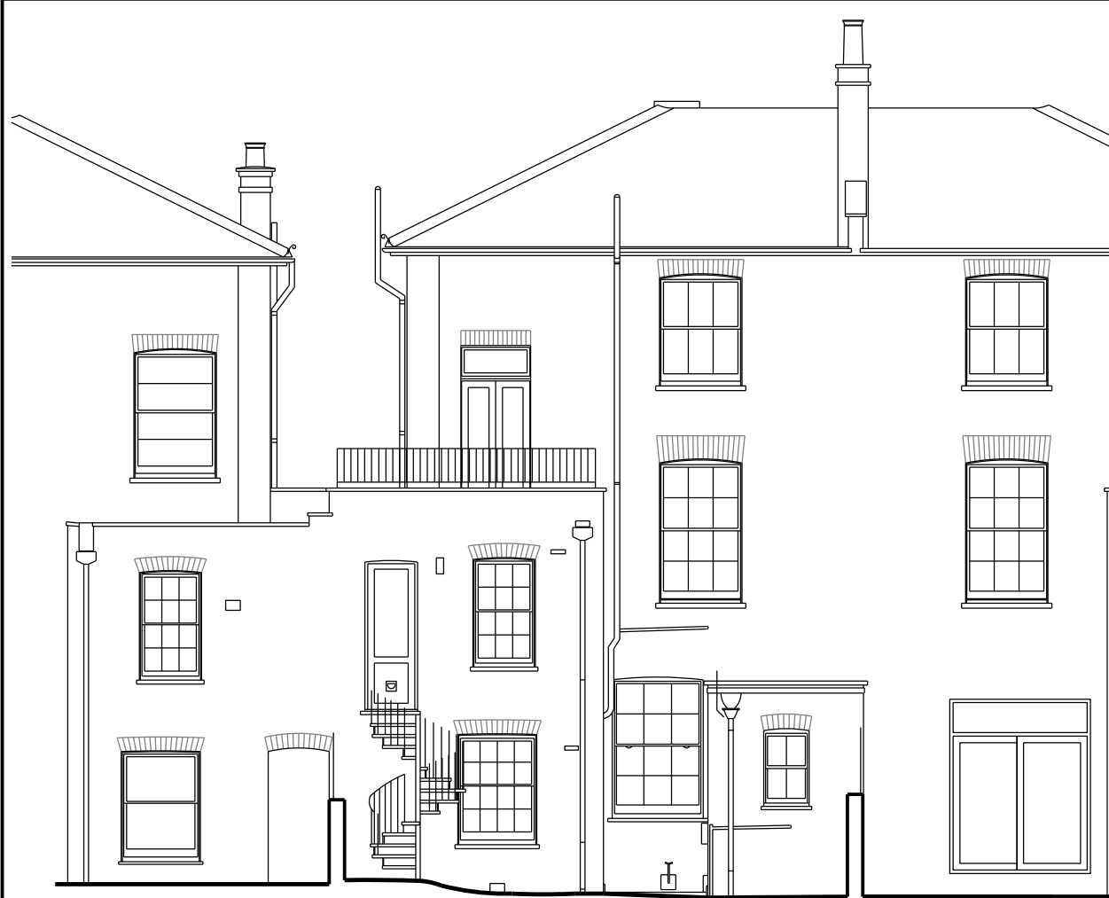
02 Existing East Elevation 1:50@ A1 / 1:100@A3