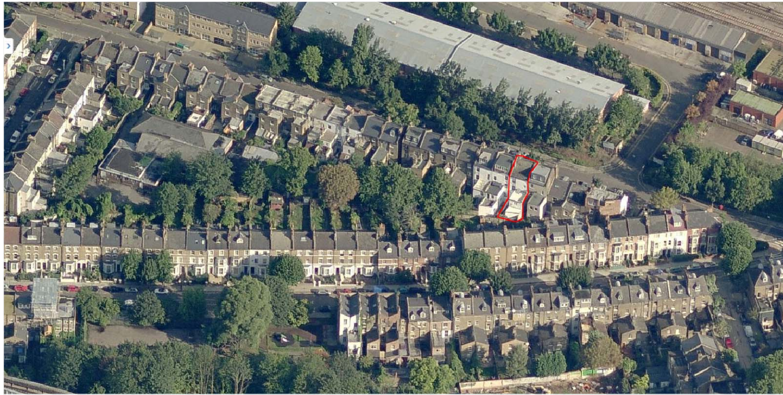
Aerial photo demonstrating neighbouring roof extensions