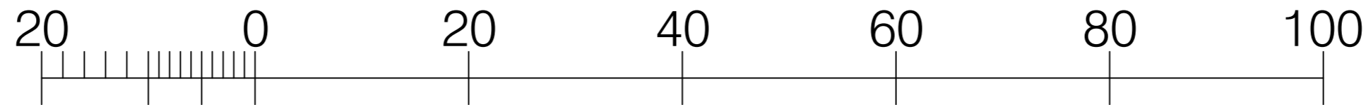
Existing Block Plan Scale 1:500