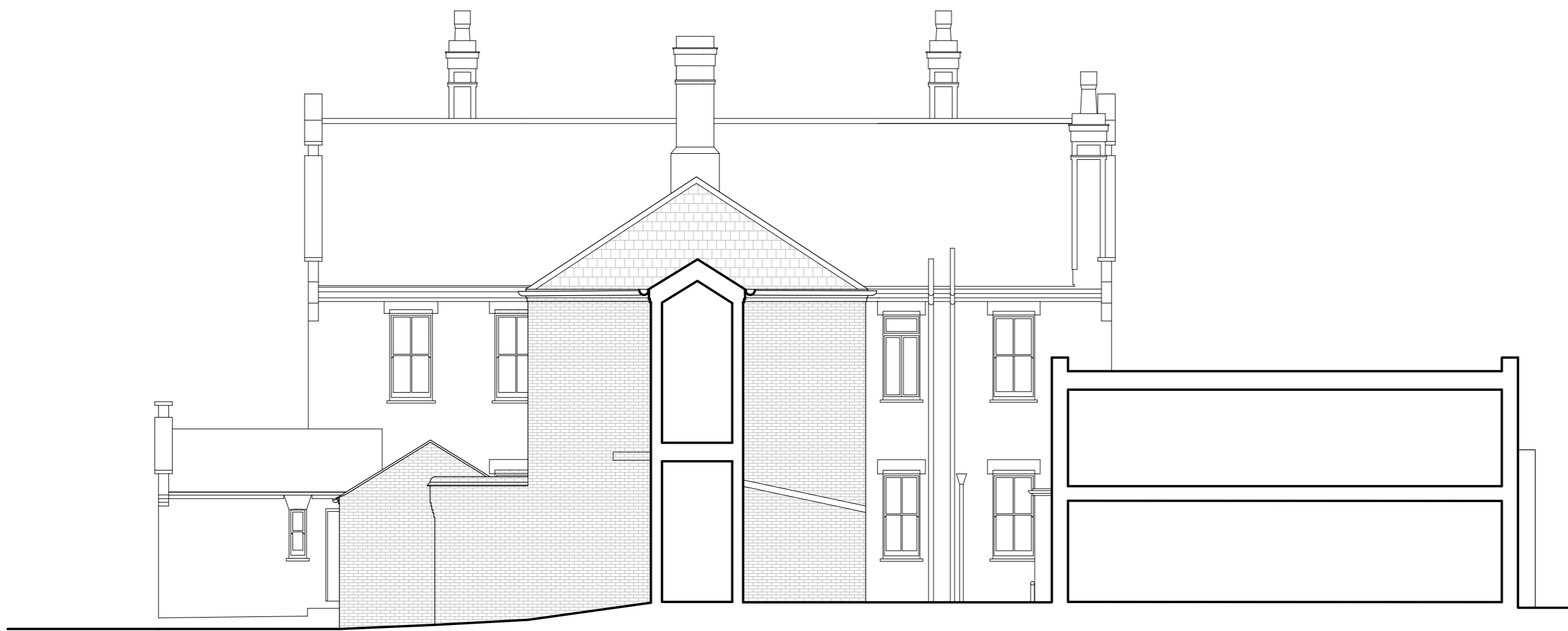
EXISTING ELEVATION 09 (South facing section / elevation through existing south building with Holmes Road front building beyond)