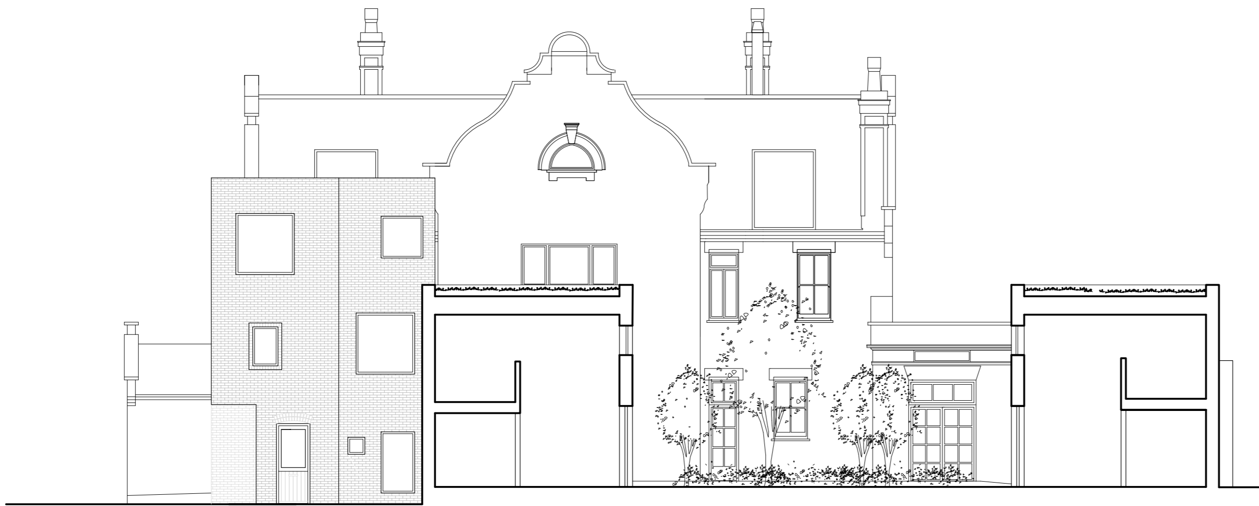
PROPOSED ELEVATION 09 (South facing section / elevation through new build with existing Holmes Road front building beyond)