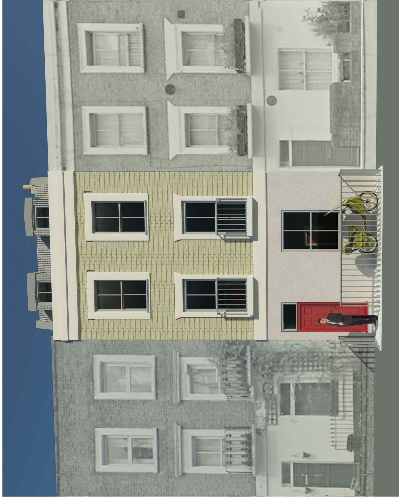
View From Opposite Pavement 3-3