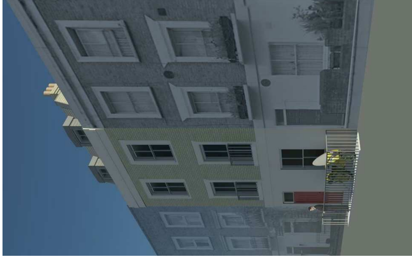
View From Opposite Pavement 2-2