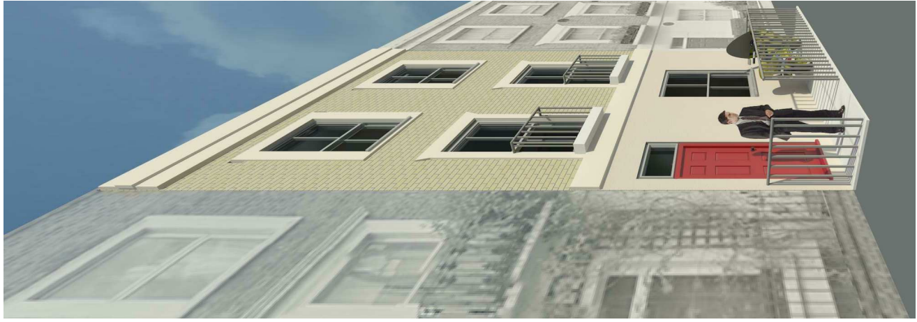
View From Pavement 1-1