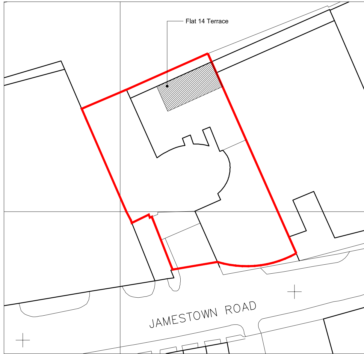
PROPOSED BLOCK PLAN SCALE 1:500