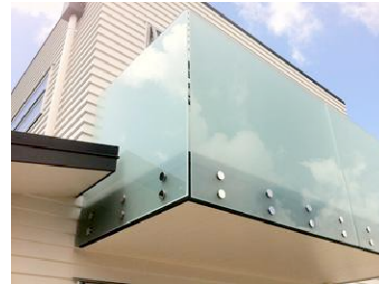
1 Obscure glass screen. Image for material reference only.