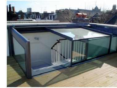
2 Lightweight structure to roof access. Glazing to be low g value to avoid solar heat gain. Image for reference only.