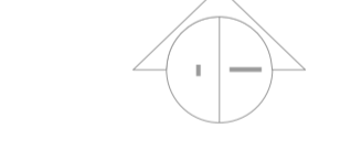
3 Key Plan 1:1250