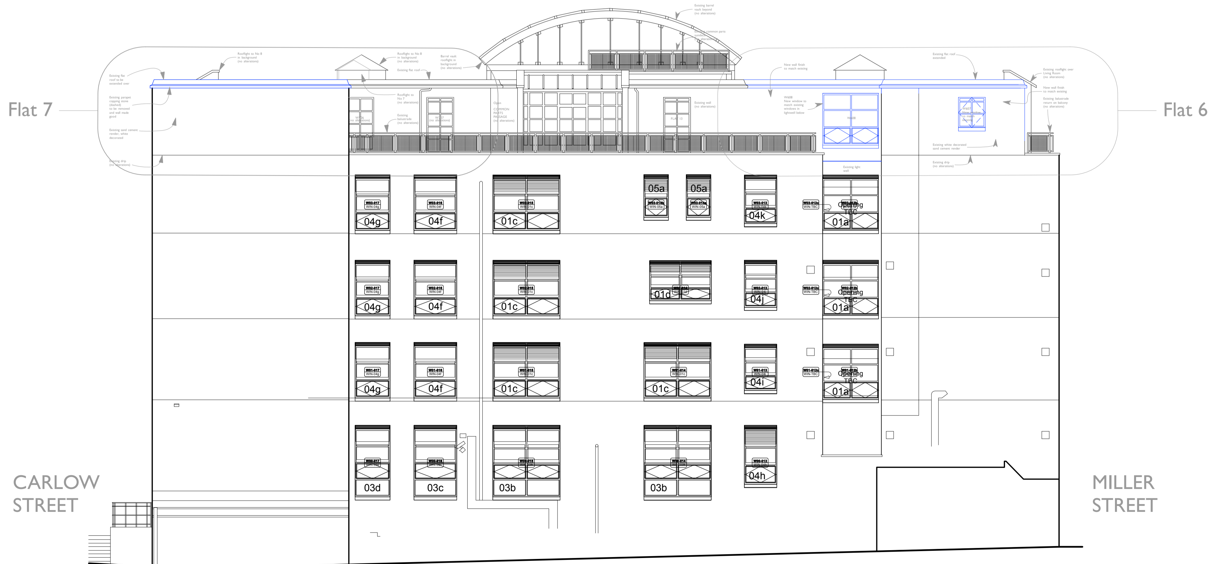
2 East Elevation as PROPOSED Scale: 1:100