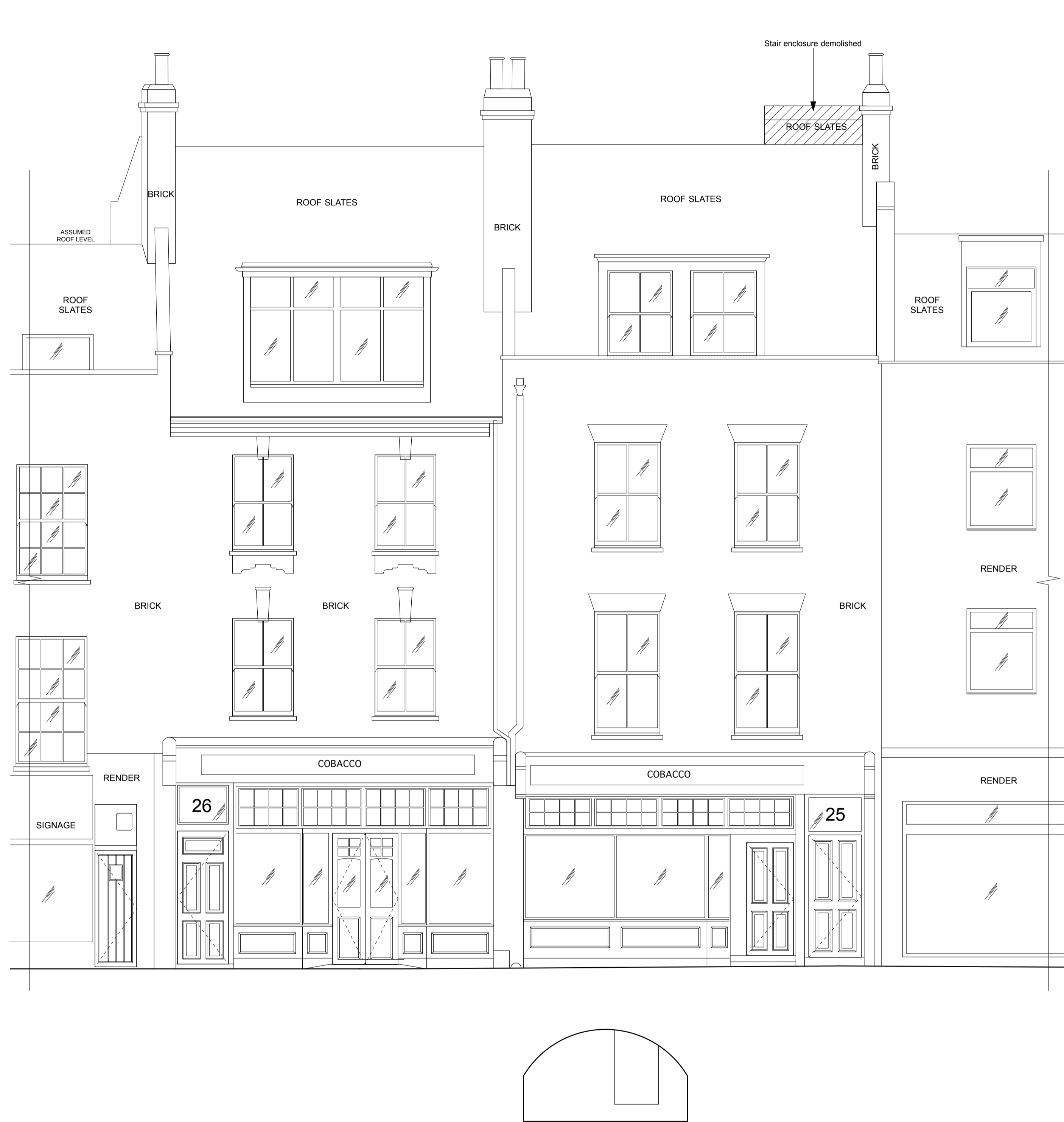
01/P05 Existing Front Elevation